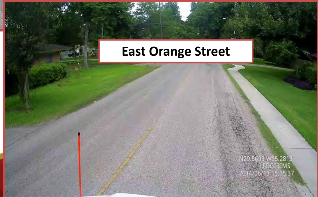
East Orange Street