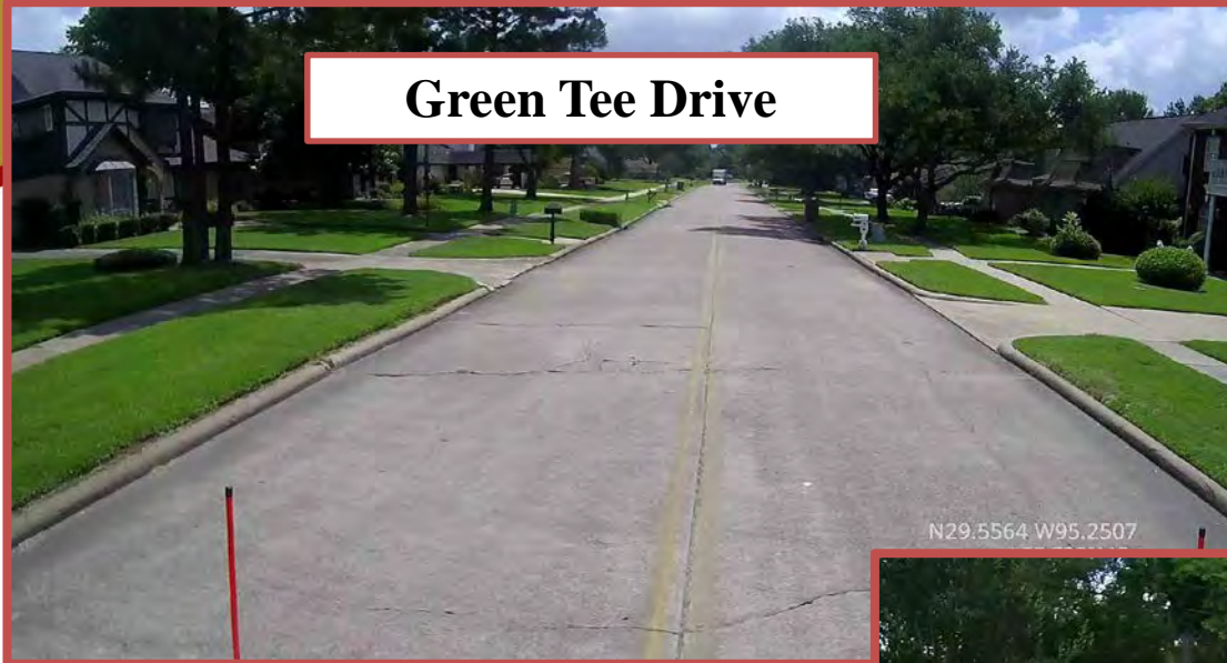
Green Tee Drive