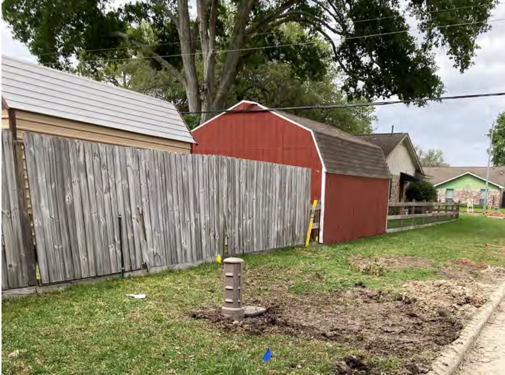
Relocated Water Sampling Station On North Street