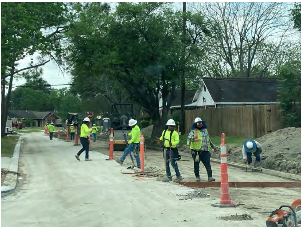
Setting Forms for Concrete Paving on the North Side of Plum Street