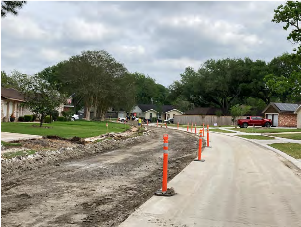
North Side of West Plum Street