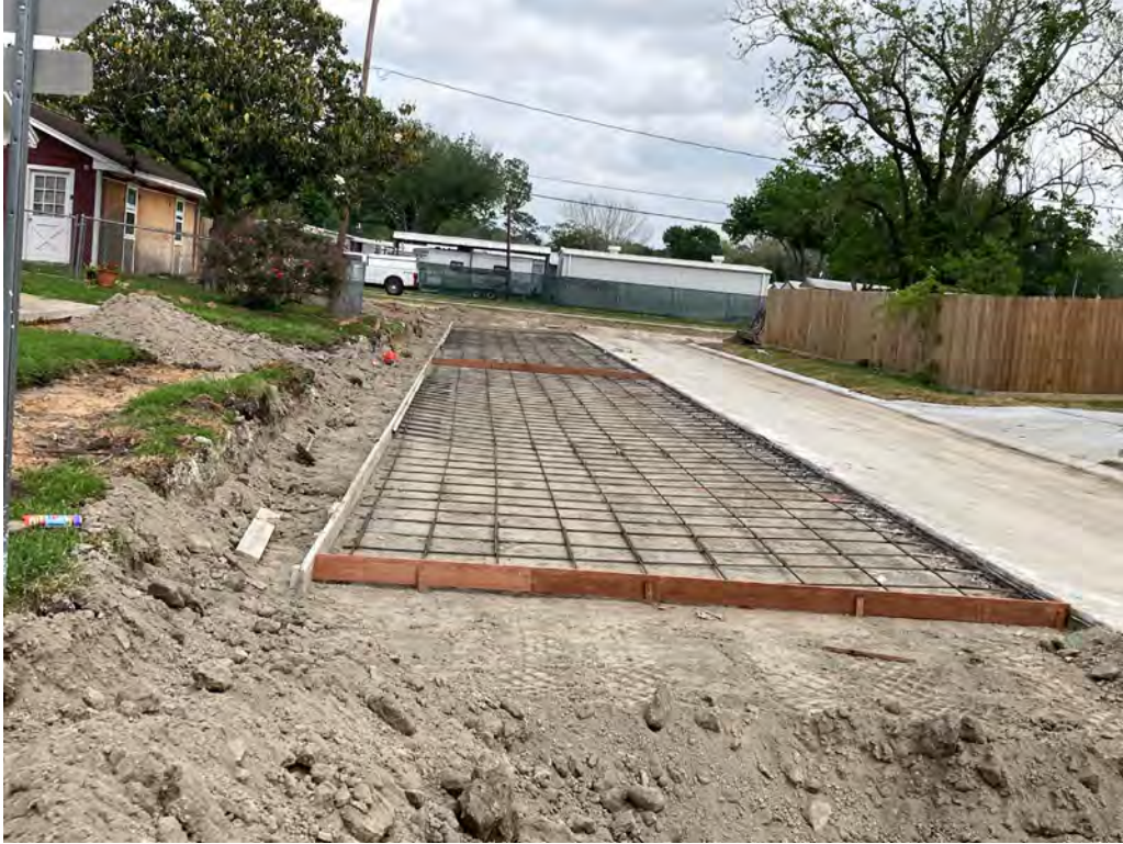
Forms and Steel for Paving on the East End of Plum Street