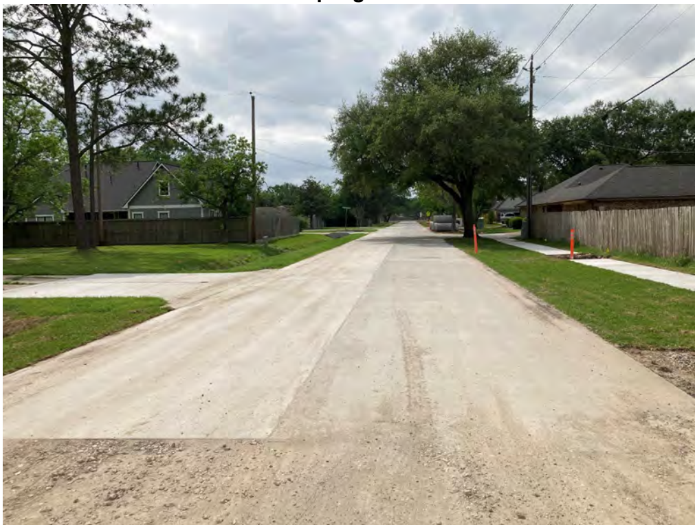
Paving, Sidewalks, Driveways and Sod on Cherry Street