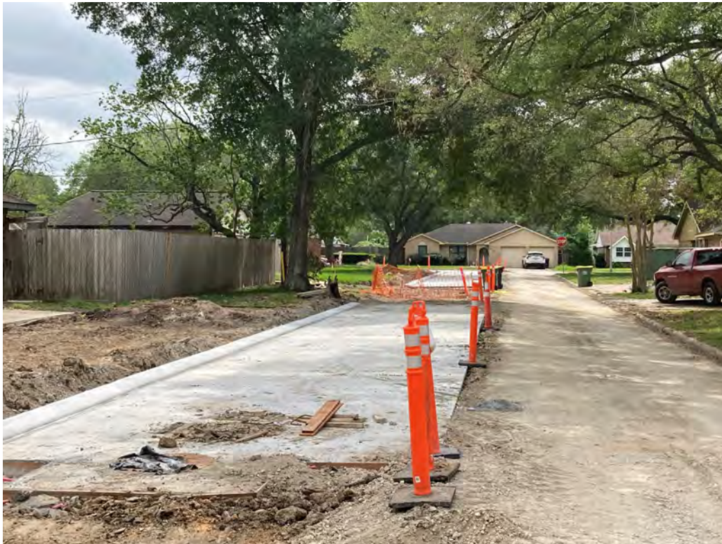
Concrete Paving on the East Side of North Street