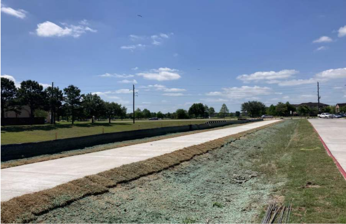
First Half of the Library Trail