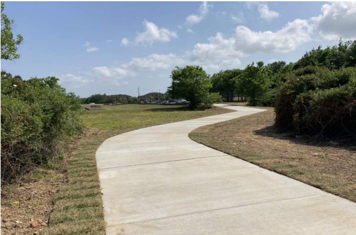
Second Half of the Library Trail