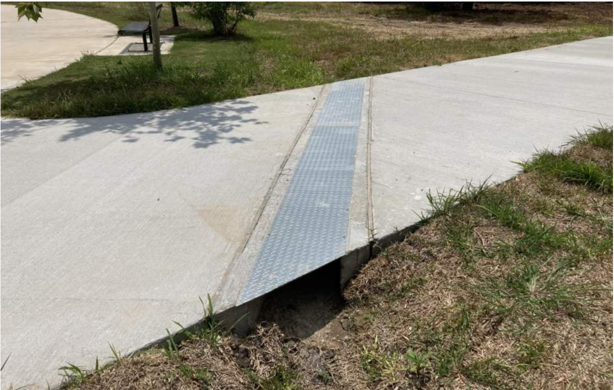
Trench Drain with Diamond Plate Installed