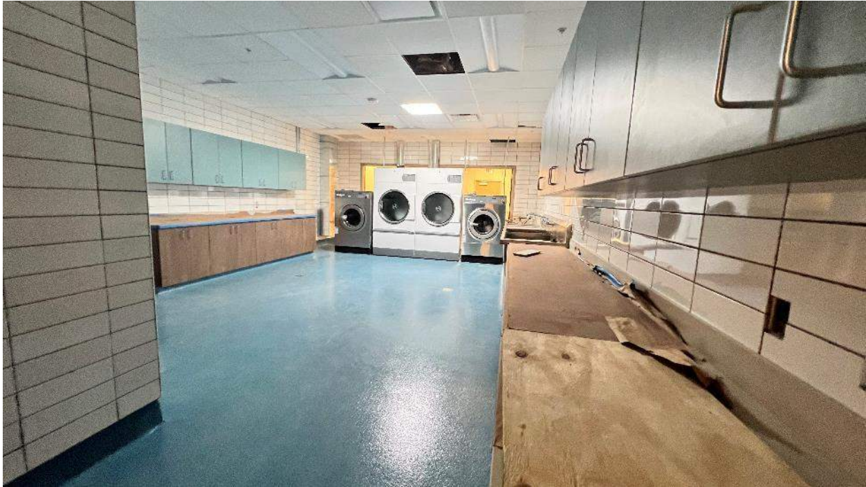
Utility Room has Been Furnished With Finished Epoxy Flooring