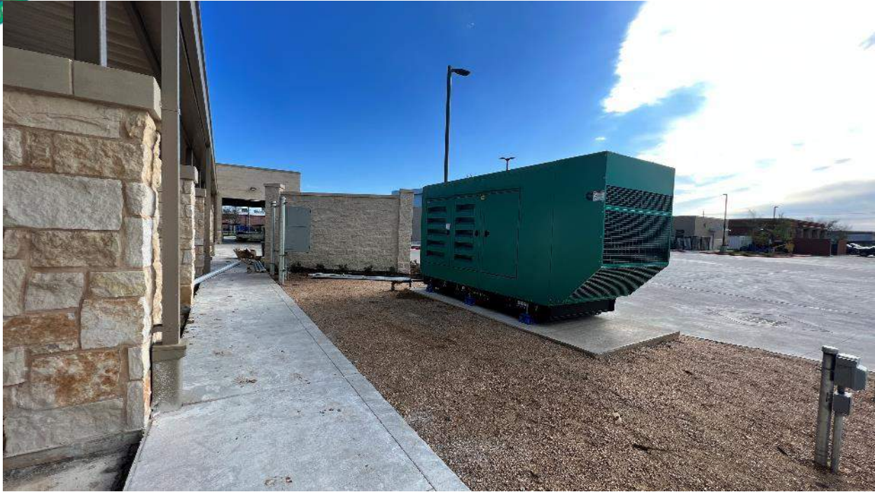
Installed Emergency Generator