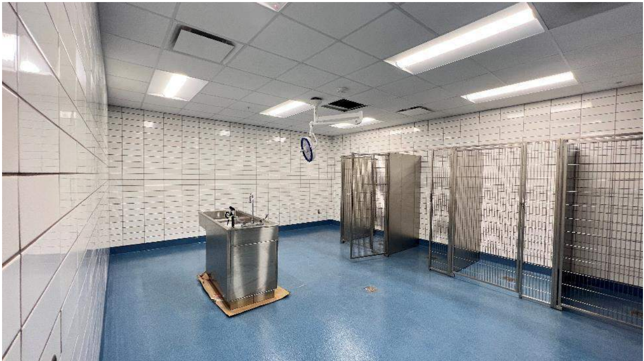
Surgical Room Lighting Fixtures and Kennels Installed