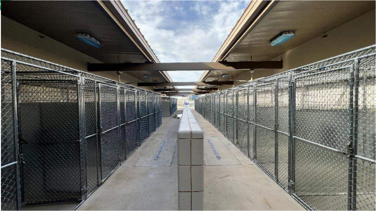
Central Outdoor Dog Run