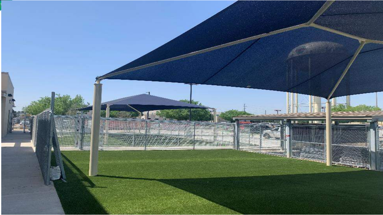
Outdoor Play Areas at Rear of Building