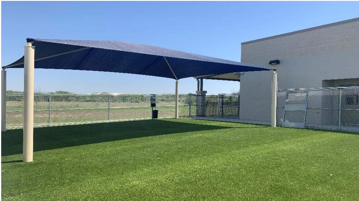
Outdoor Play Area at Rear of Building