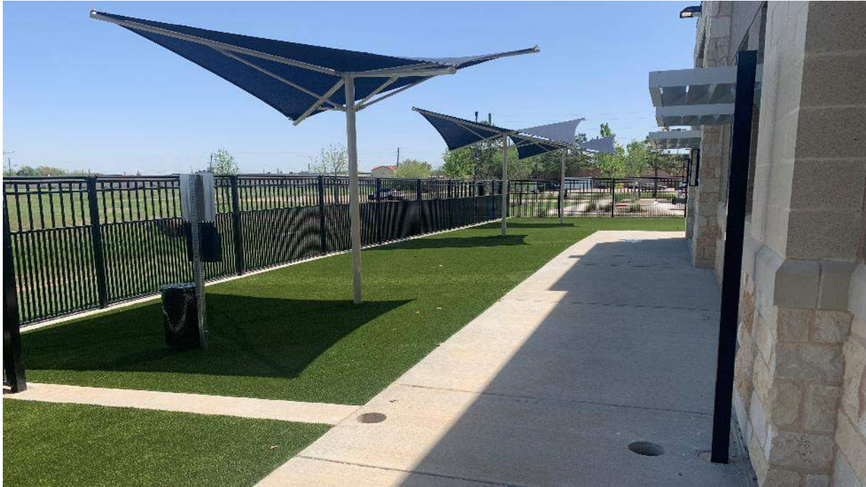
Outdoor Get To Know Area