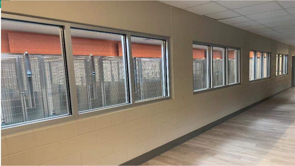
Hallway Kennel Viewing Area