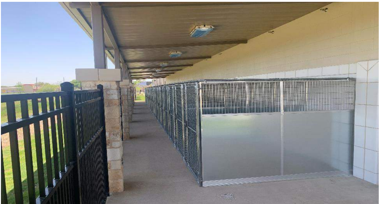
Eastern Outdoor Dog Run