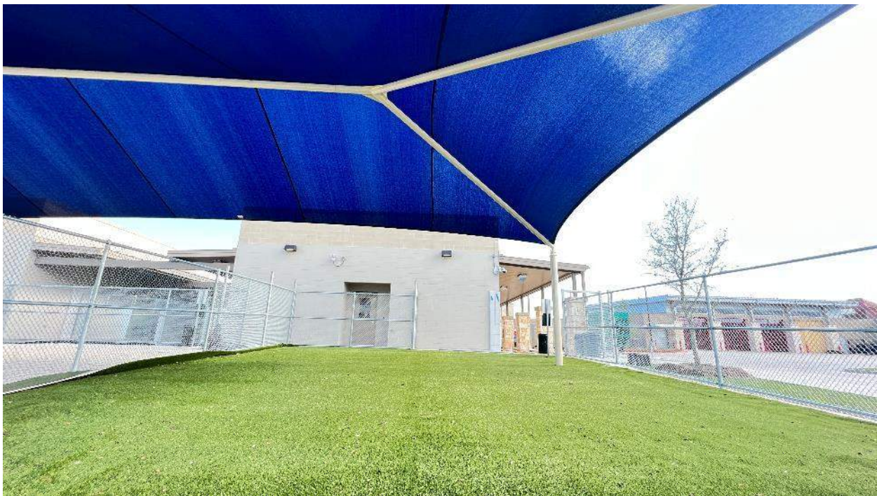
Sun Shade Canopy in Get-To-Know Area