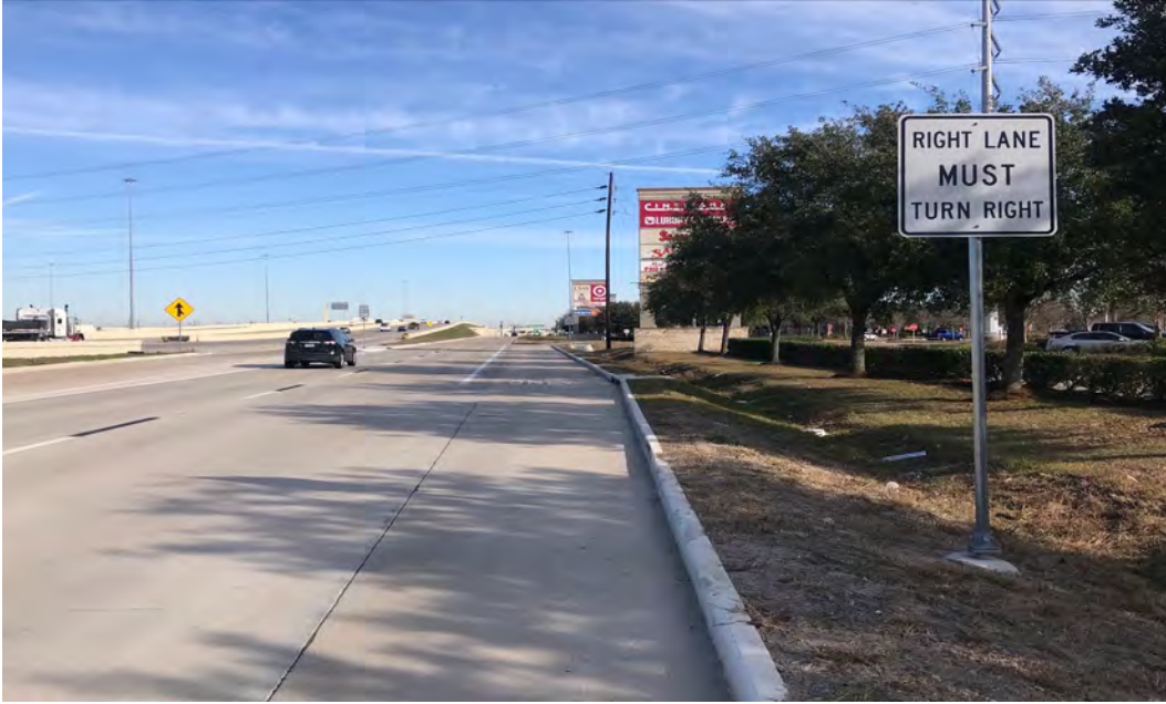
New Driveway Approach (North End)