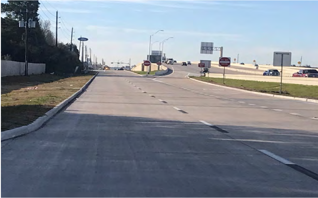
New Northbound Frontage Road Exit Ramp