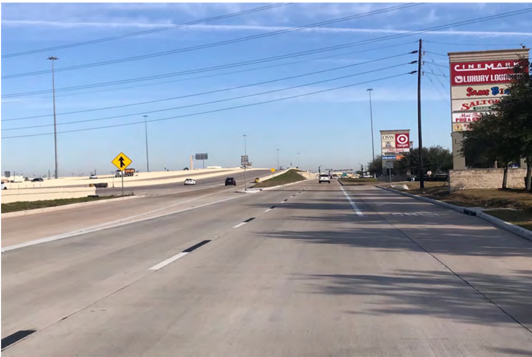
Northbound Frontage Rd Entrance Ramp