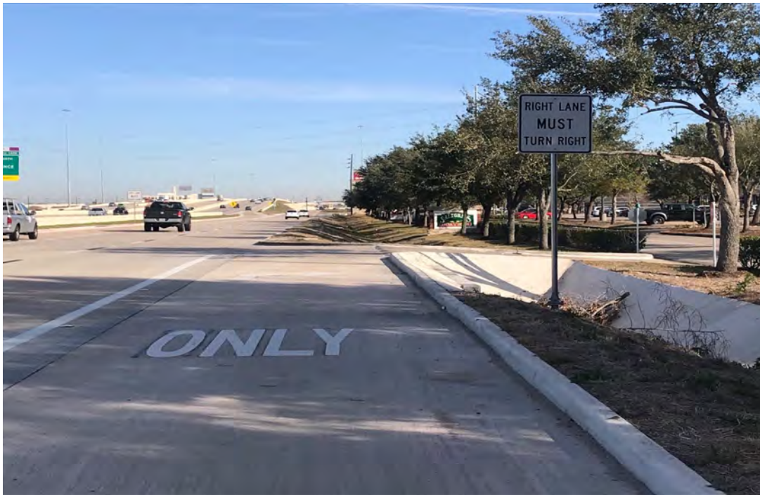
New Driveway Approach (South End)