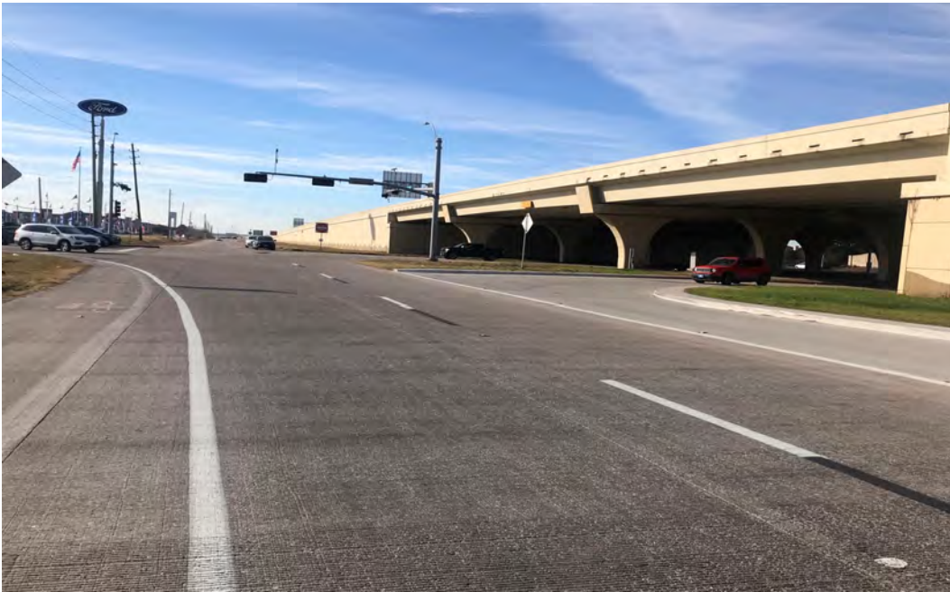
New SB to NB U-Turn