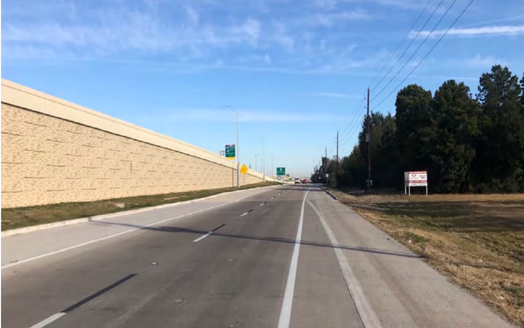
New Northbound Frontage Road