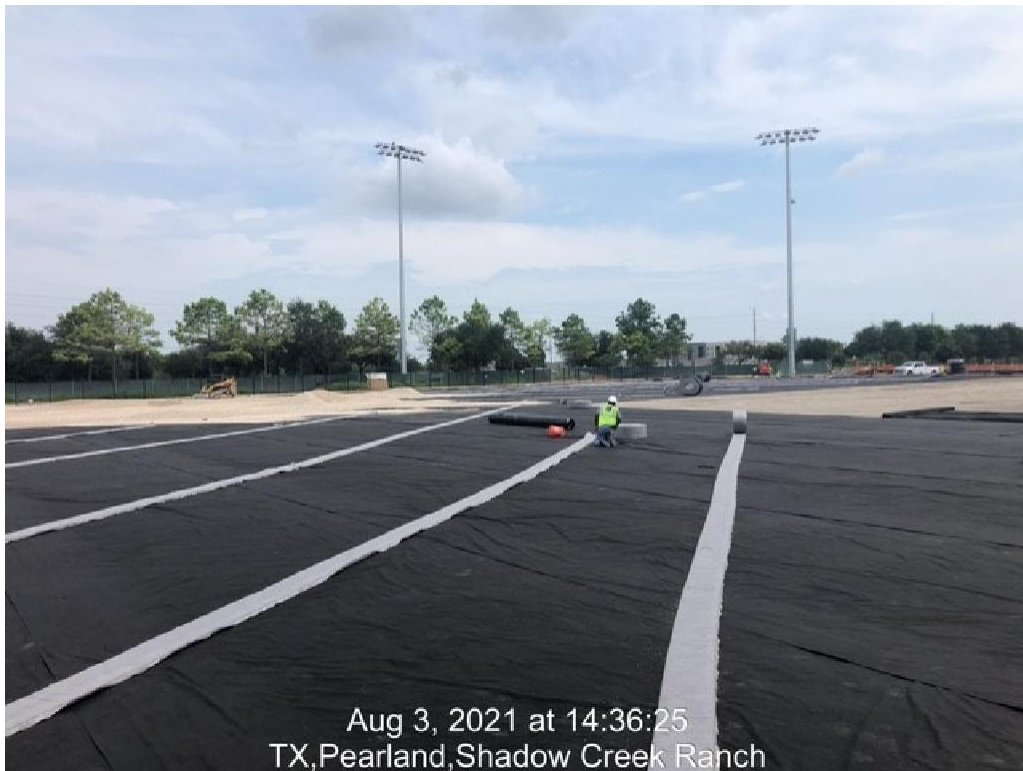
Drainage system beneath cricket field aggregate base