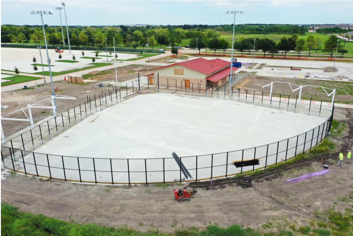
Aerial of Miracle Field, with fencing and shade structures