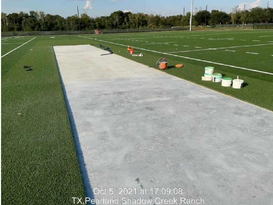
Cricket pitch concrete underlay