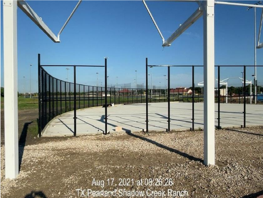
Install of Miracle Field shade structures