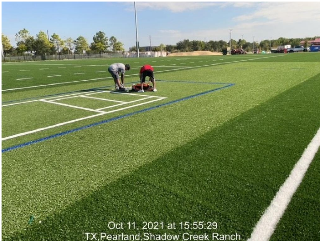
Cricket pitch synthetic turf installation and field markings