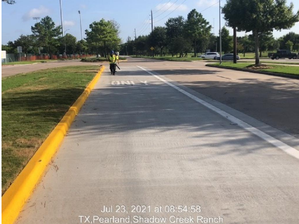
Completed left-turn lane from Kingsley Road