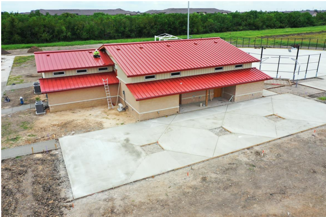
Aerial of Concession Building North-facing entrance