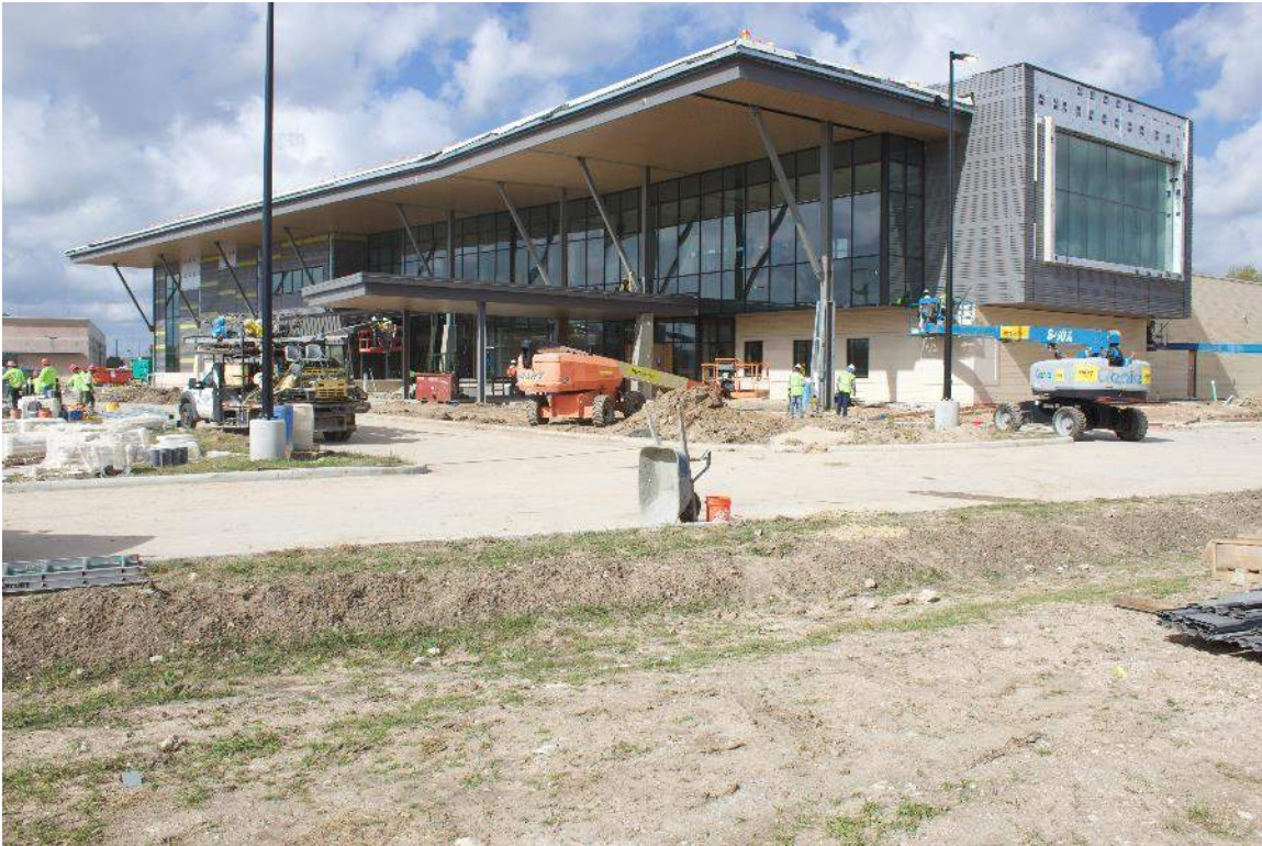
Exterior Finishes are Nearing Completion