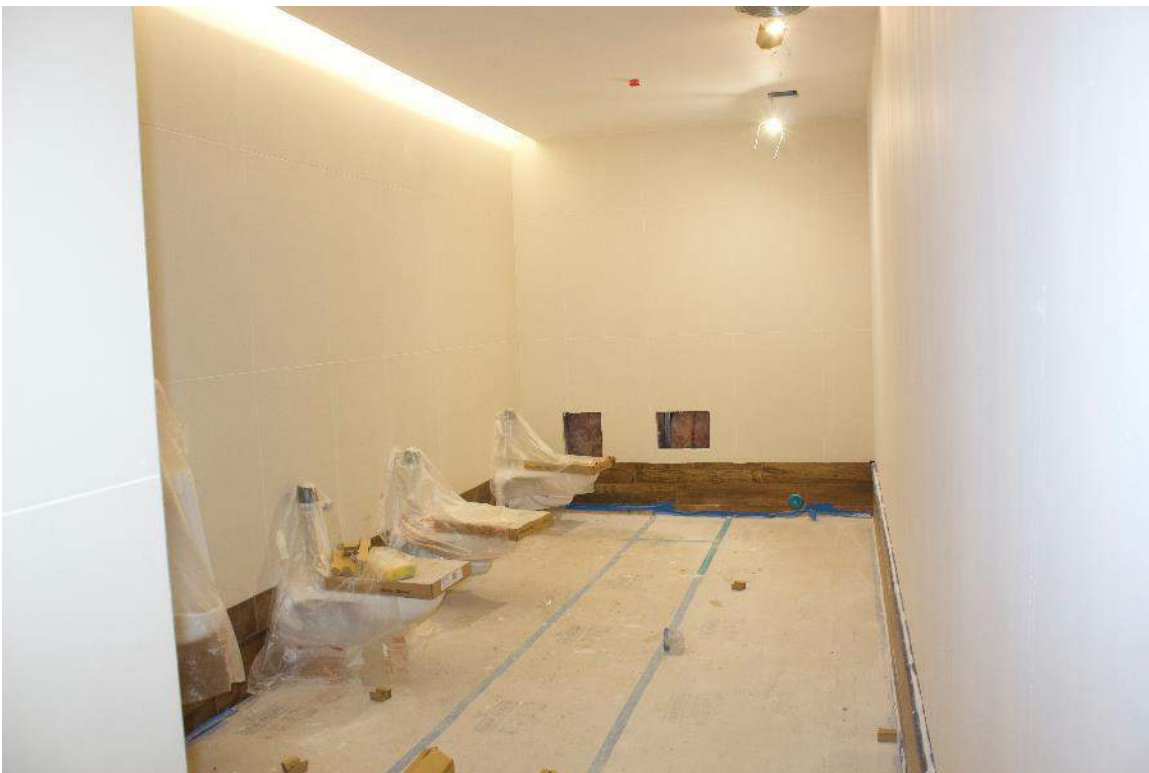
Plumbing Fixtures Have Been Installed