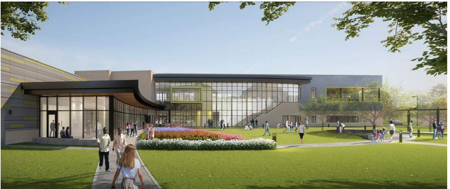
Rendering of Exterior Rear View