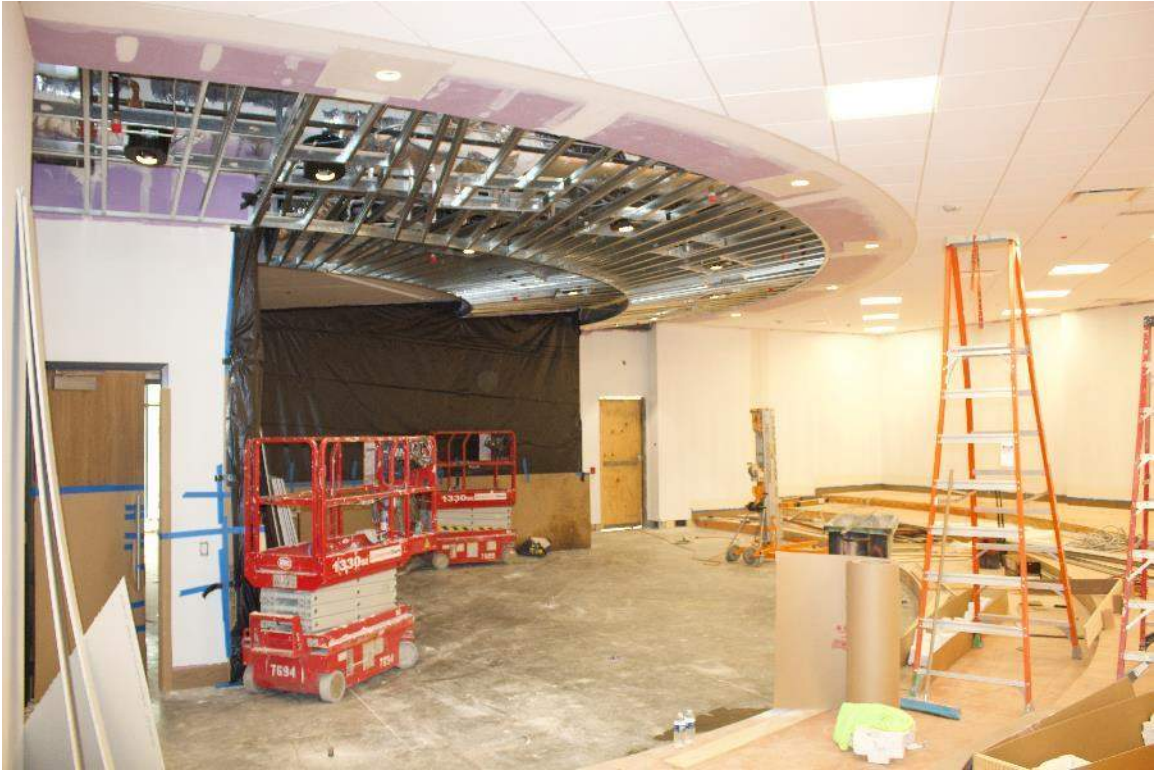
Teaching Theater is Nearing Completion