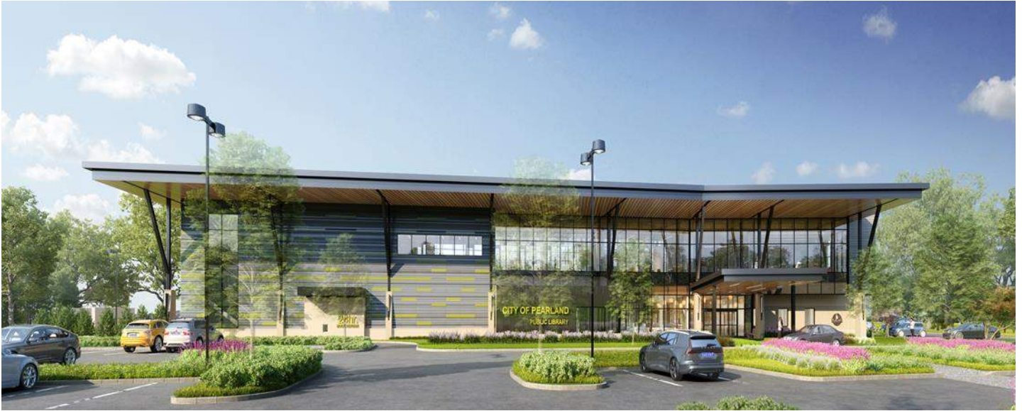
Rendering of Exterior Front View