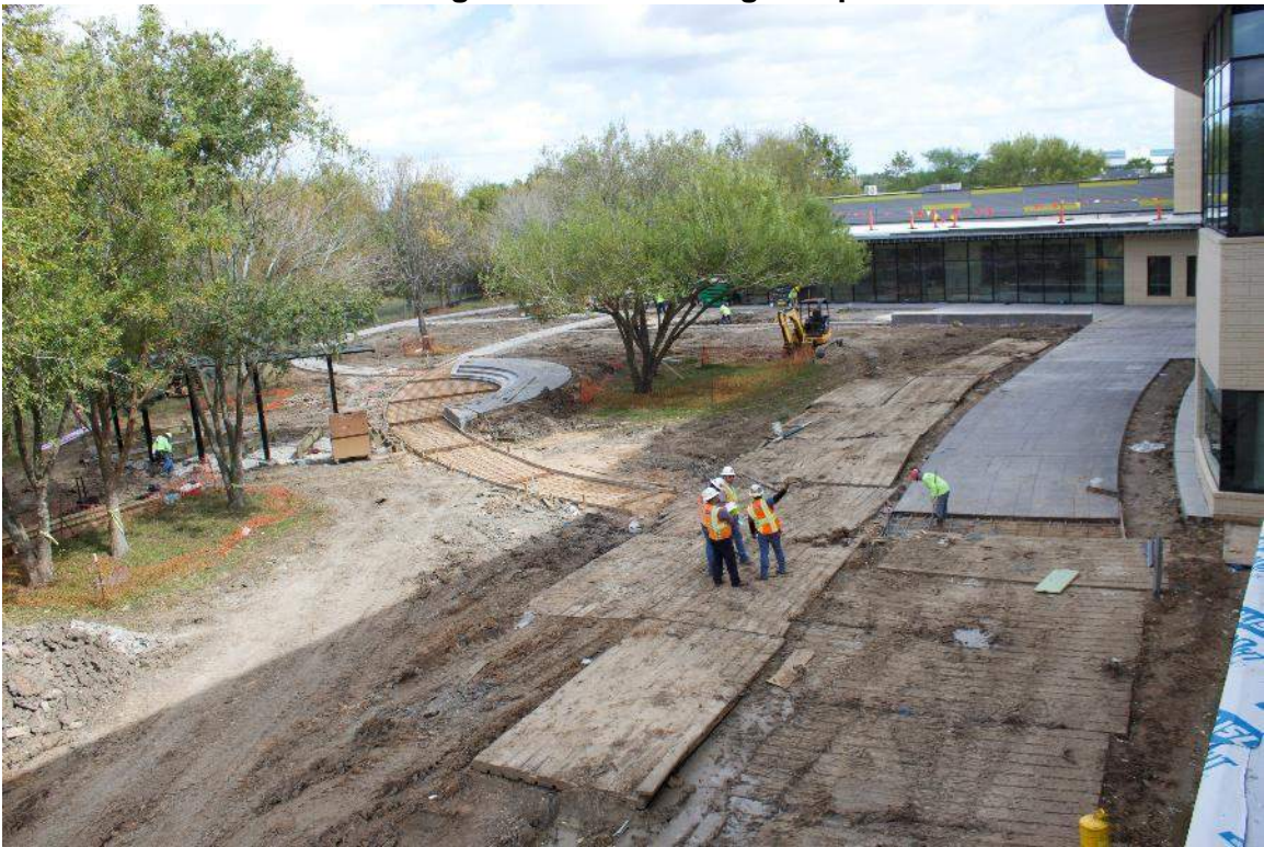
Rear Courtyard and Amphitheater