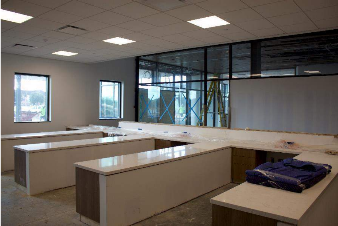
Millwork in Tax Office Has Been Installed.