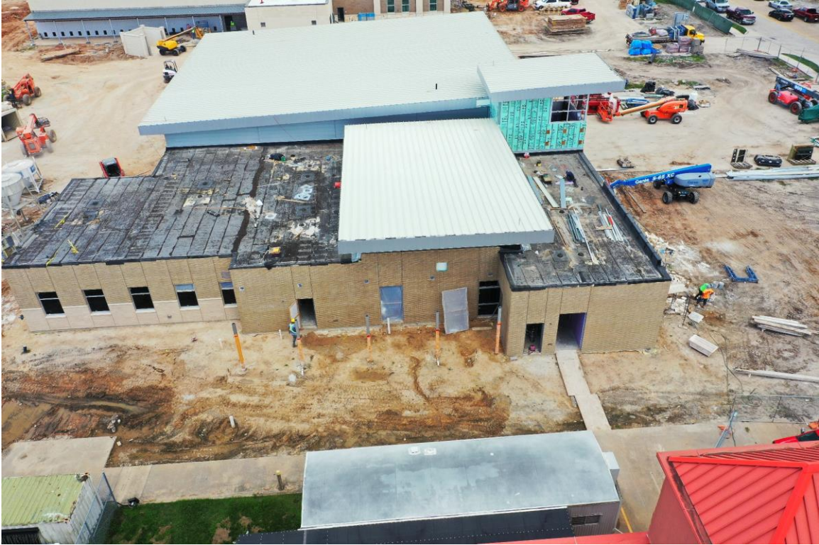
Western Face of Fire Station #4