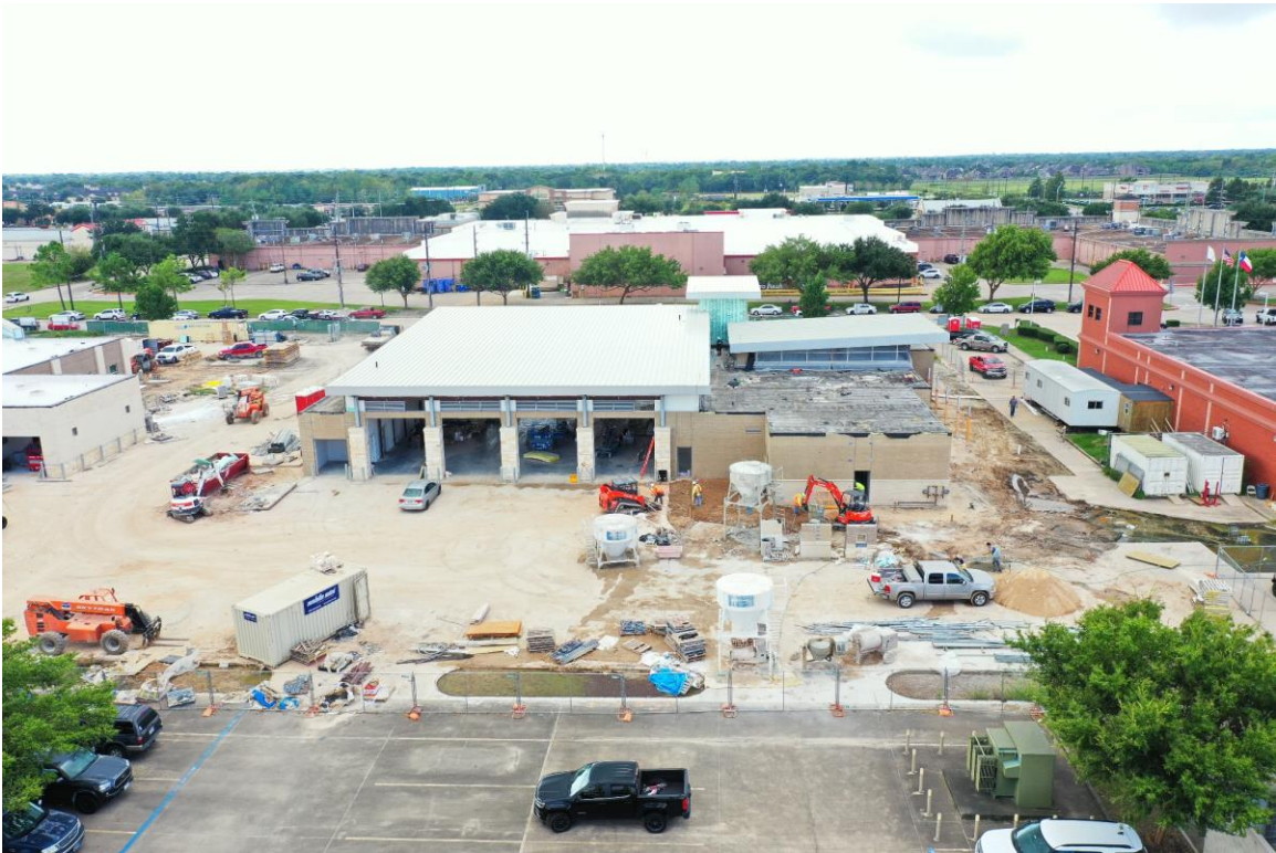
Rear Bay Doors of Fire Station #4