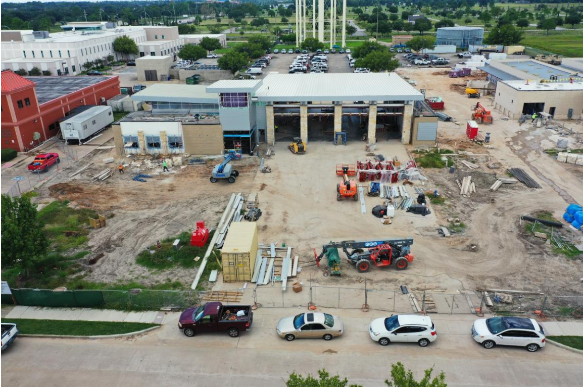
Freedom Drive Side of Fire Station #4