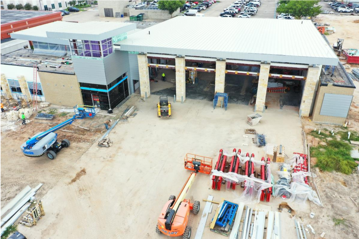
Front Bays of Fire Station #4