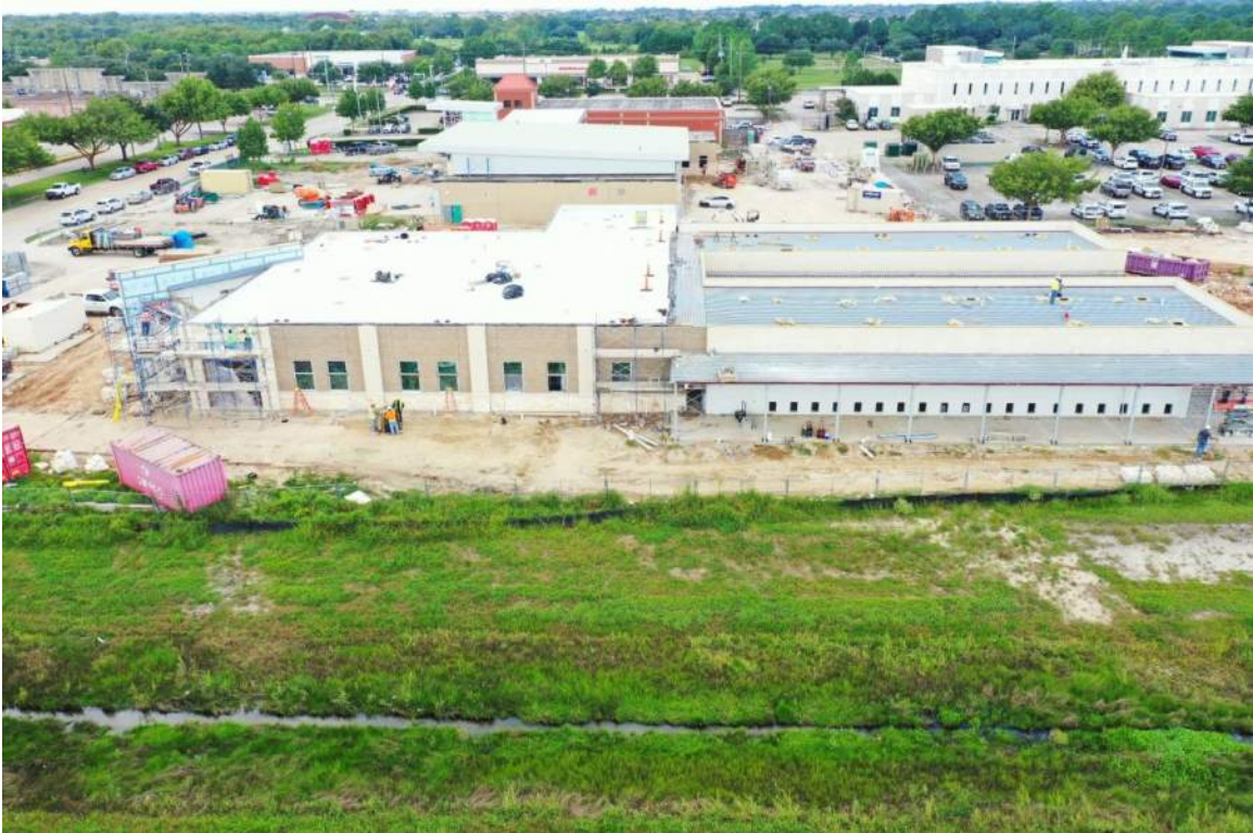
Eastern Side of Animal Shelter