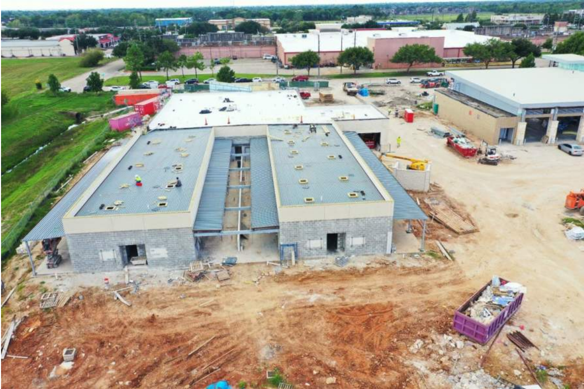
Roof Over Dog Kennels and Outdoor Runs has Been Installed