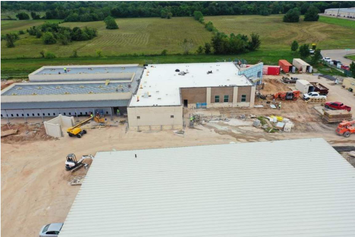
Western Face of Animal Shelter