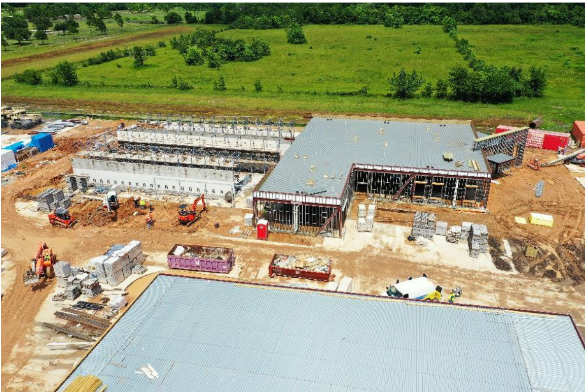
Metal Roof Pan Complete and Ready for Insulation