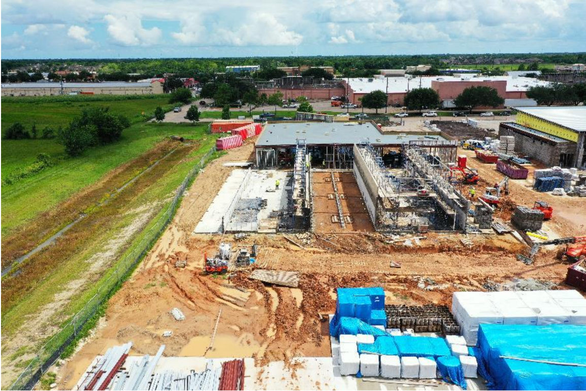
Dog Runs on Back of Animal Shelter