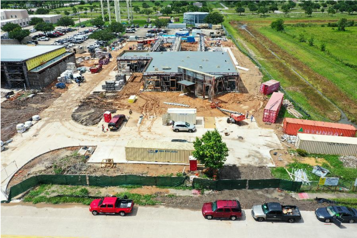
Metal Stud Framing Complete on Exterior