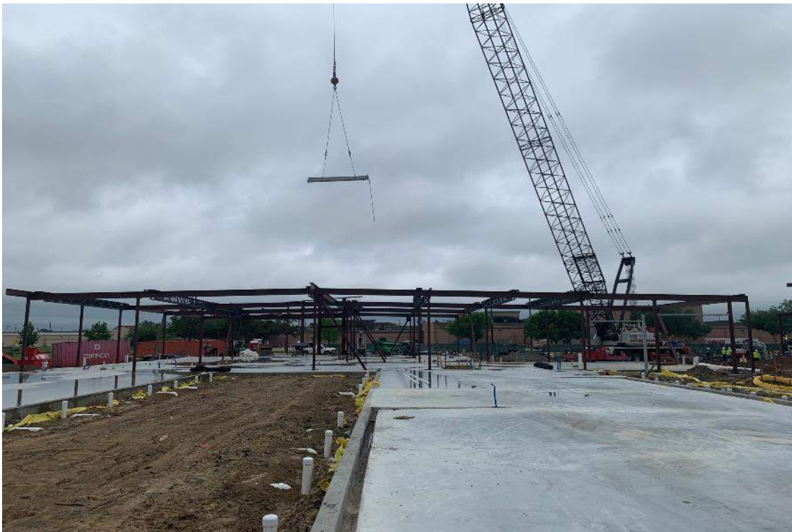
Steel Being Erected