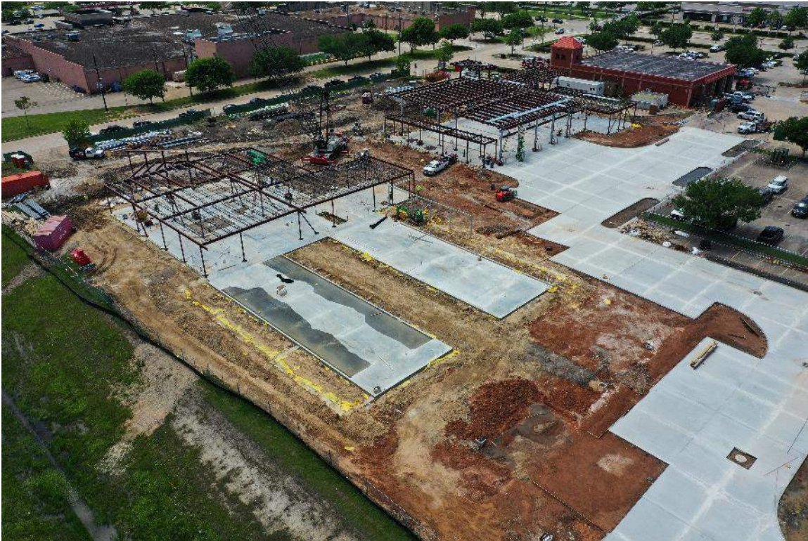
Steel Being Erected on Animal Shelter