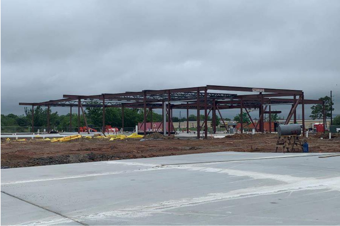
Structural Steel being Erected