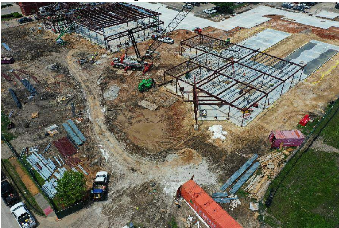
Steel Being Erected