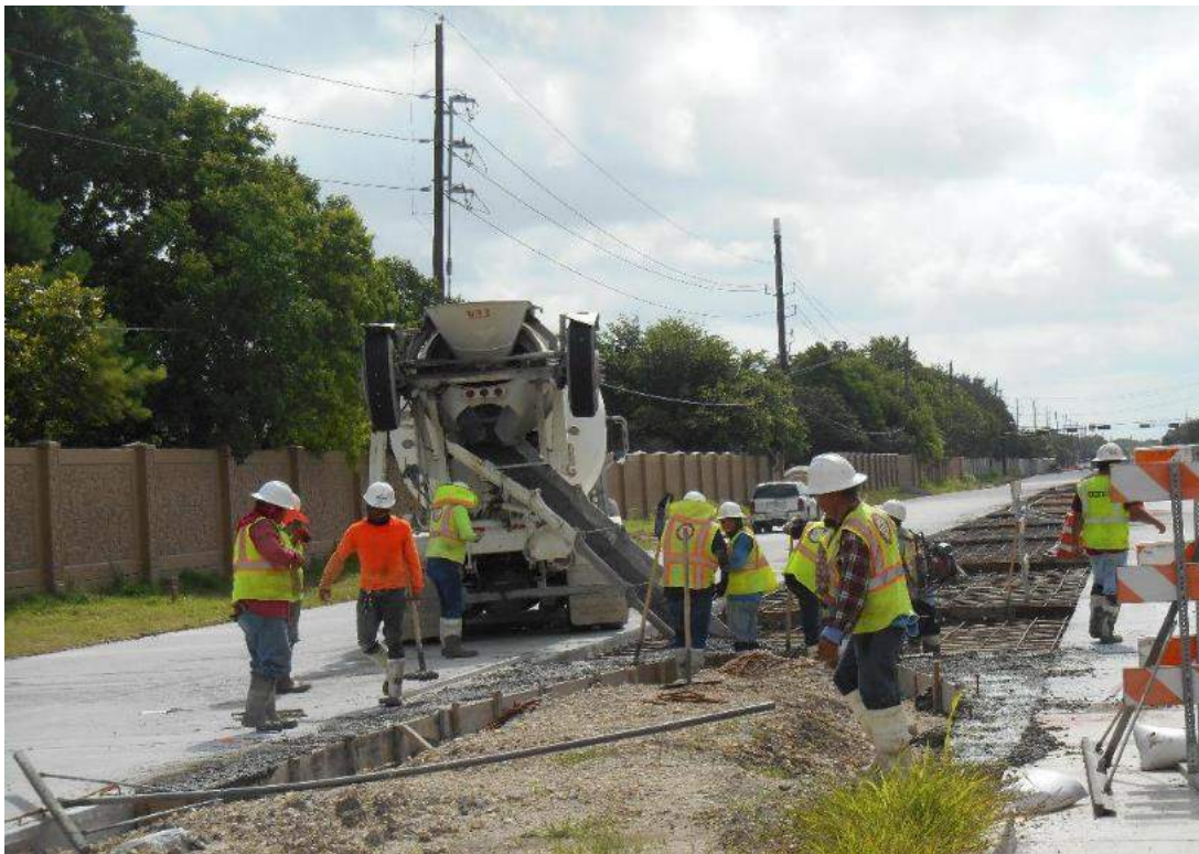
Pouring median cut in esplanade