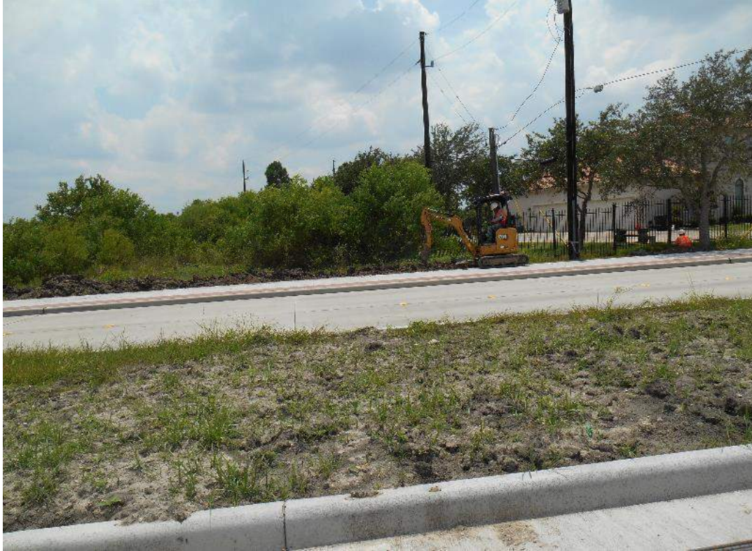
Installation of Irrigation main along south side