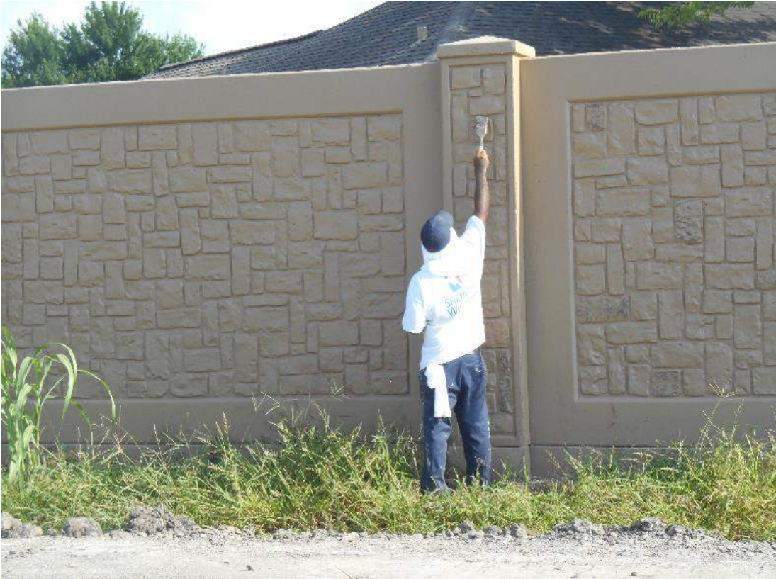
Touch-up painting of Sound wall base color