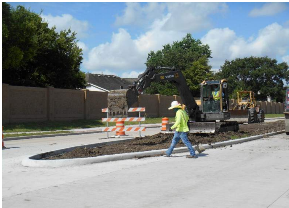
Backfilling medians after pouring median cut pavement