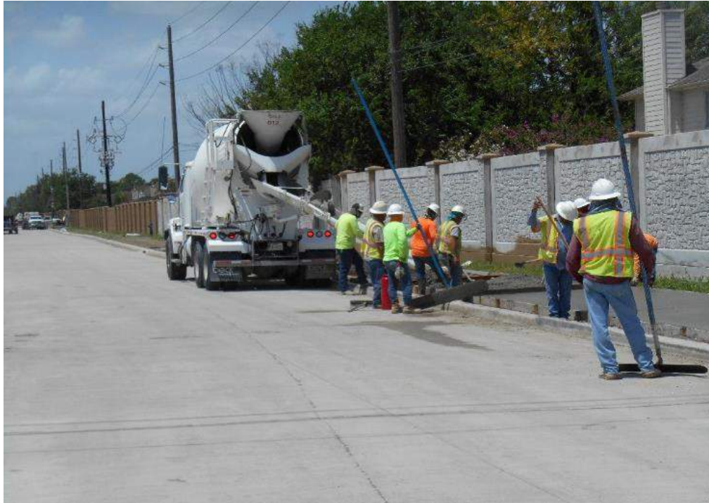
Sidewalk construction along north side