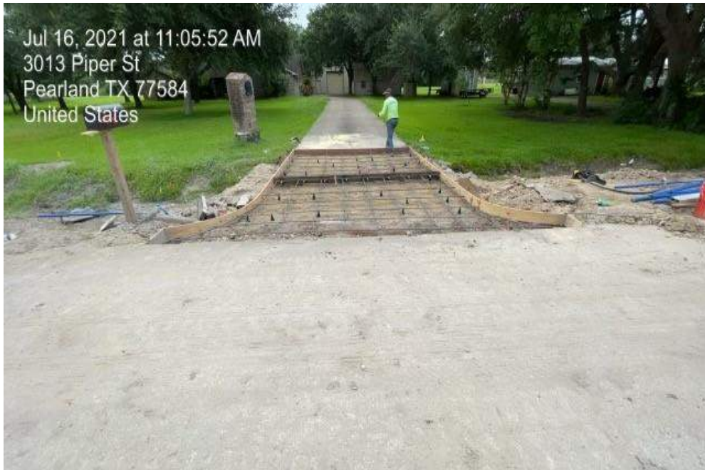
Installation of New Driveway Foundation