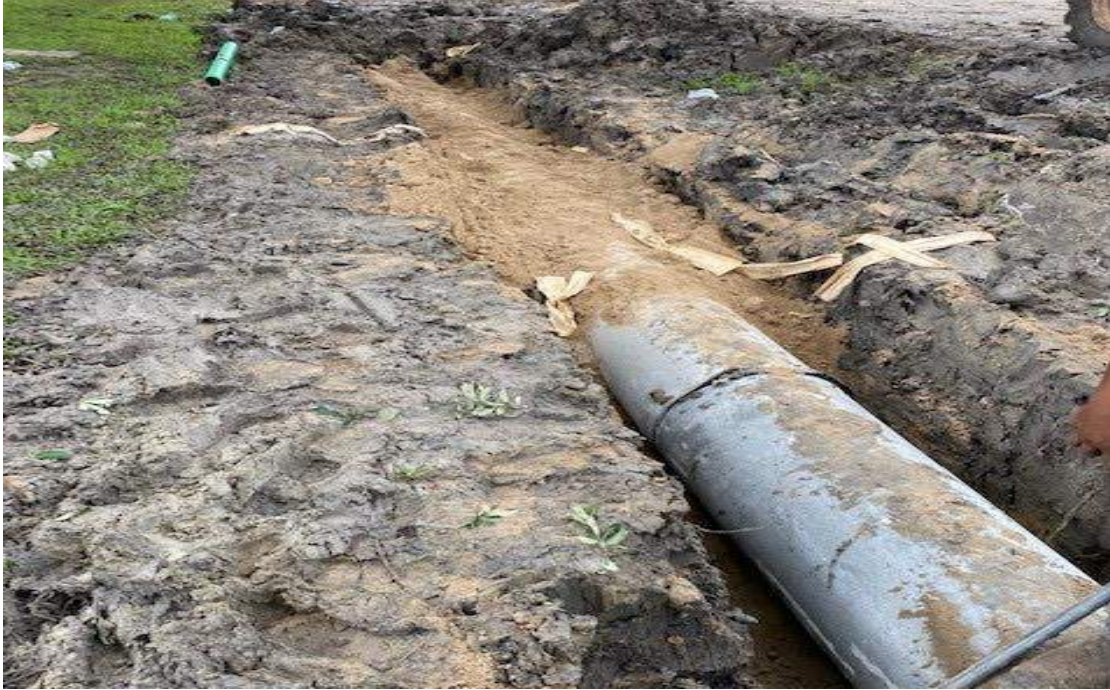
Installation of RCP Pipe