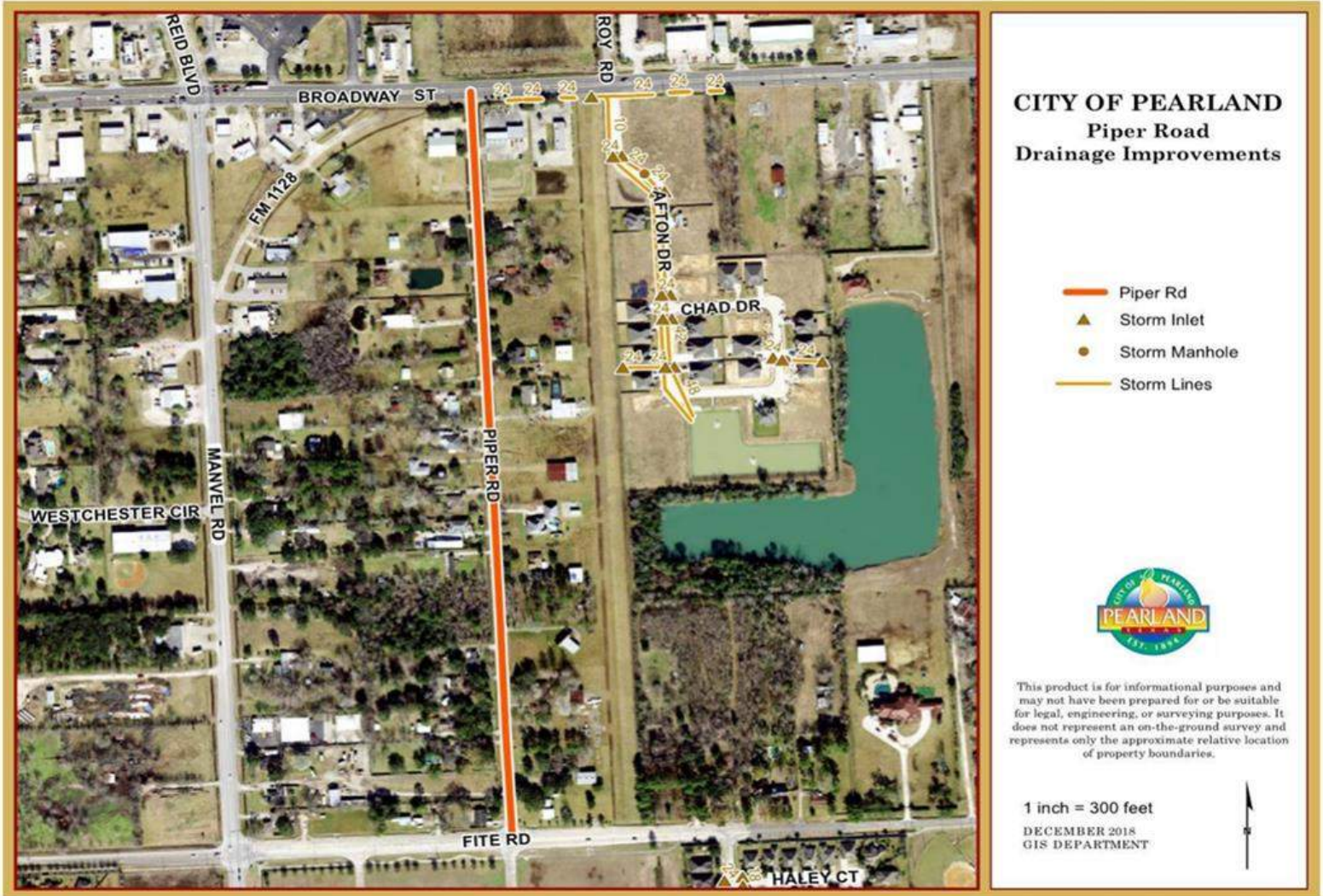
Area of Improvements Map Location