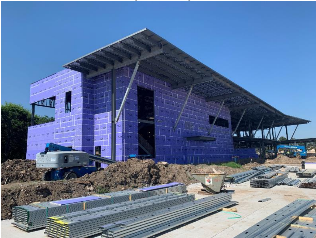
Sheathing and Air Barrier Being Installed on Exterior Steel Framing