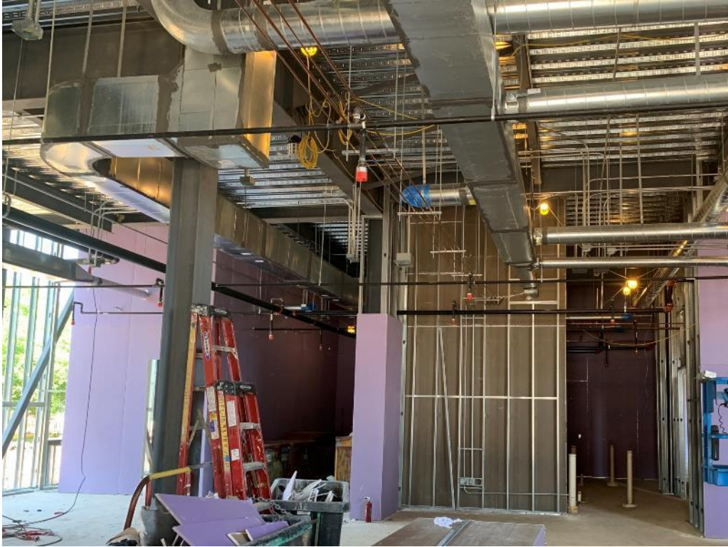
Interior Framing and MEPs are Being Installed