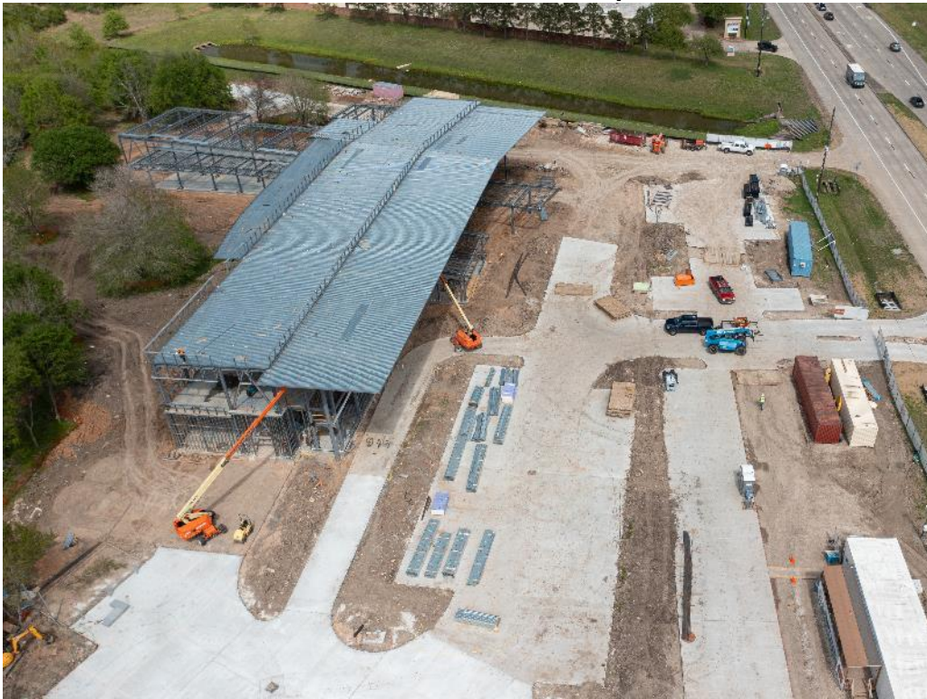
Fifty Percent of Total Paving has been Poured On-Site