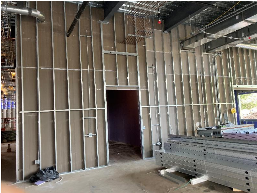
Drywall is Being Installed on One Side of Interior framing