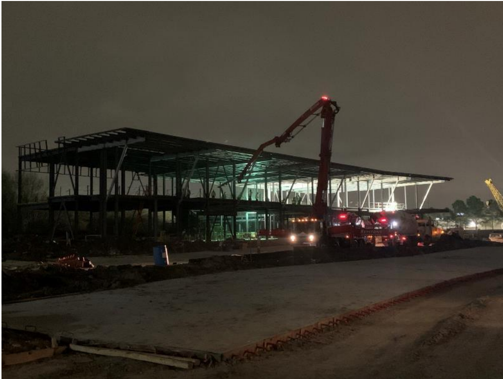
Second Floor Being Poured