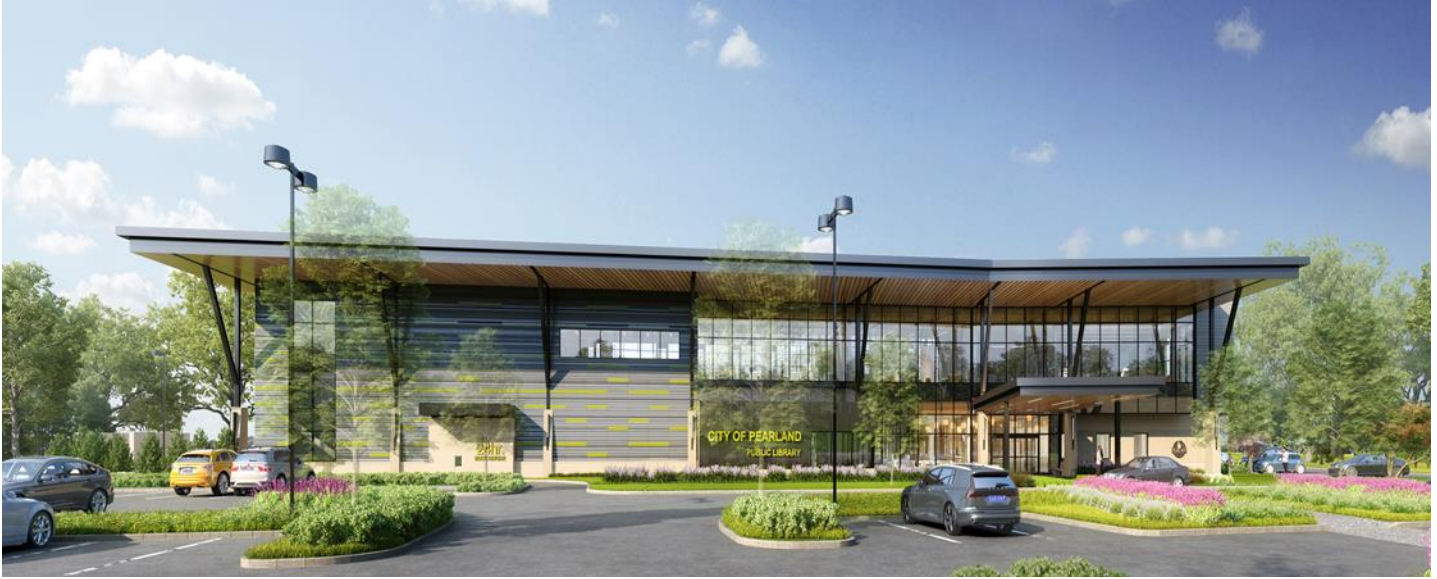
Rendering of Exterior Front View