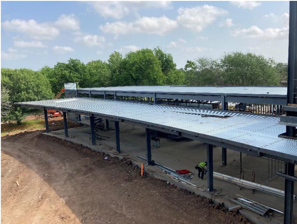
Roof Above Multipurpose Rooms and Theatre