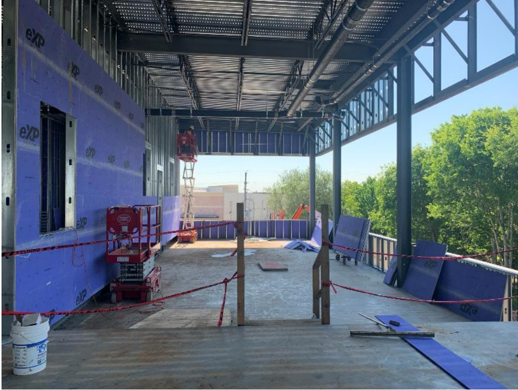
Covered Outdoor Seating Area, Being Framed and Sheathed