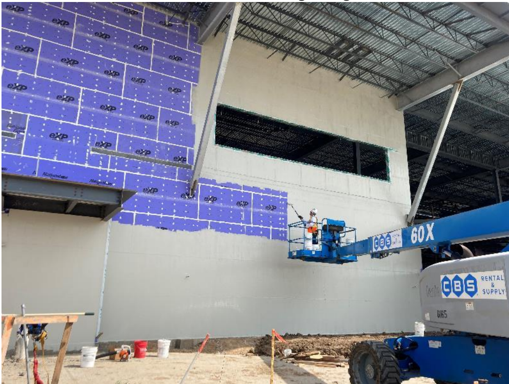
Air Barrier Being Applied