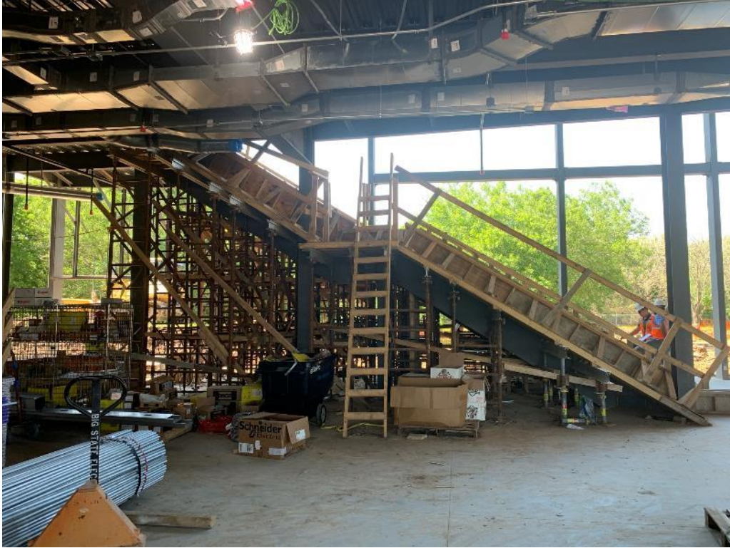
Monumental Stairs Temporary Shoring and Framing Erected