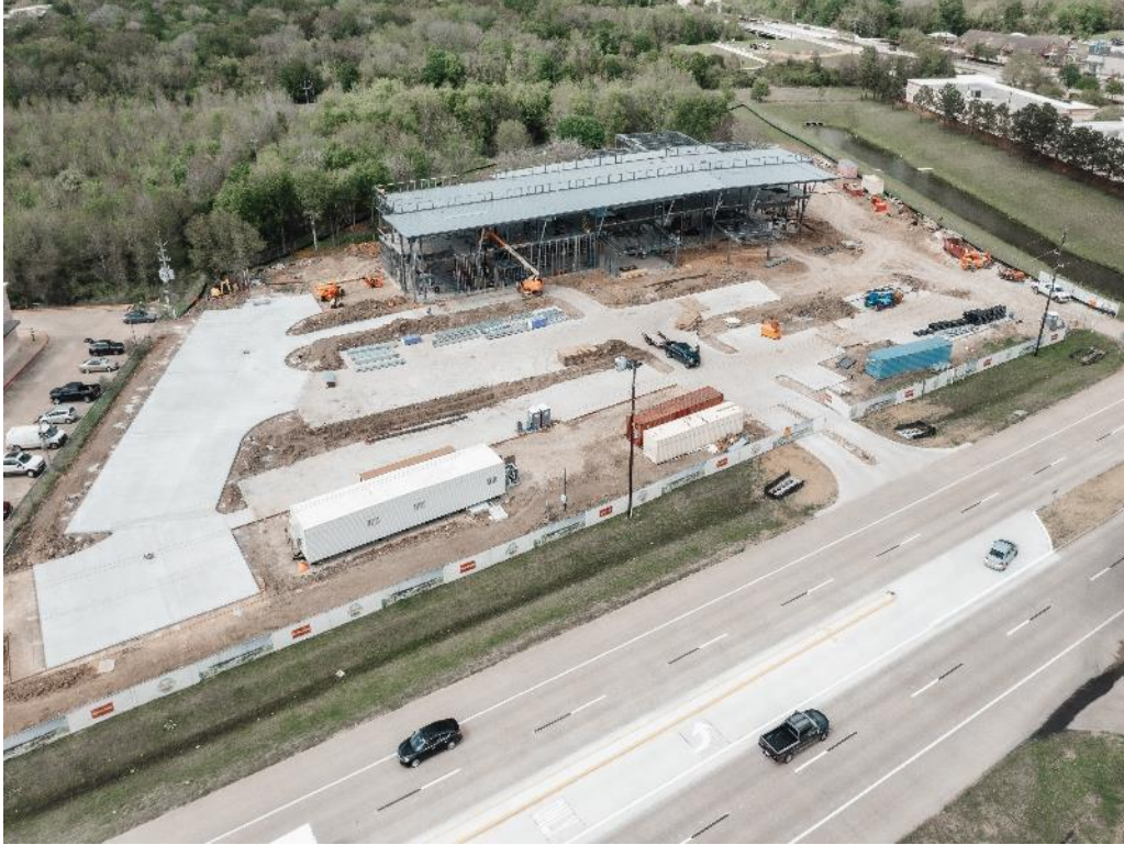
Left-Turn Lane has been Completed