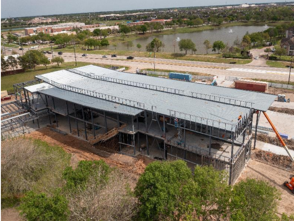
Detail Steel and Roof Decking Being Installed