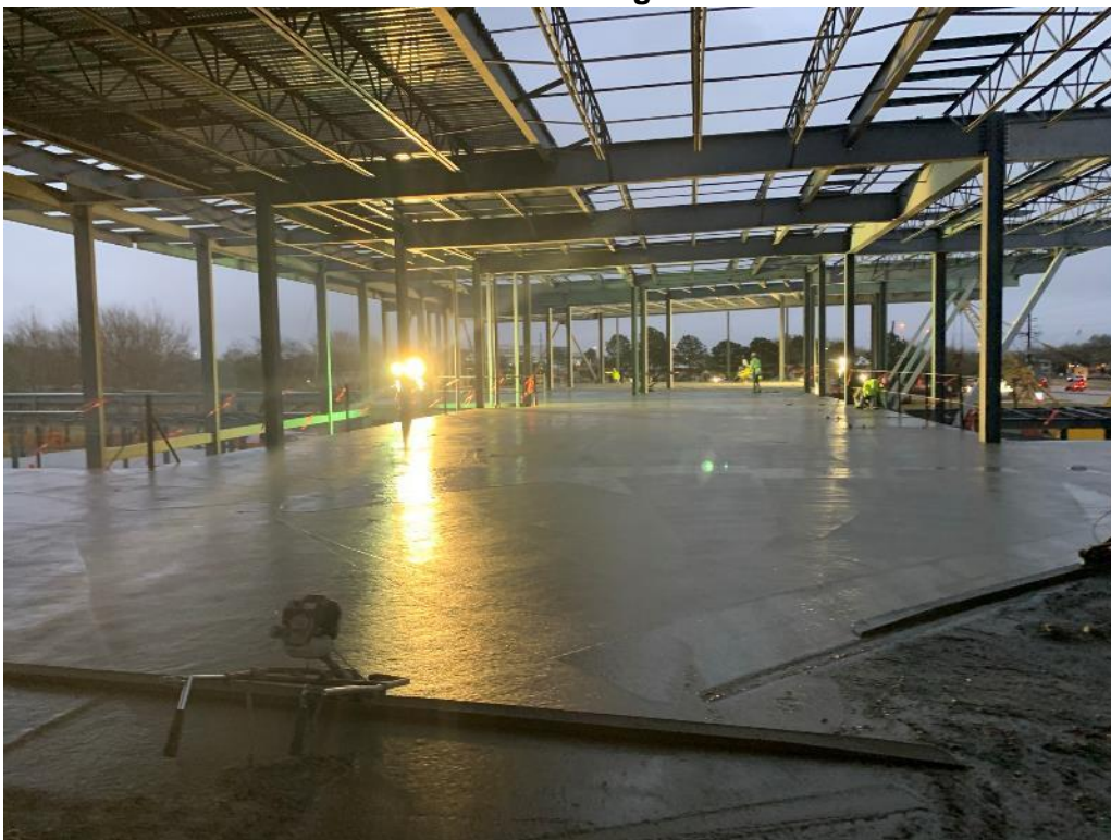
Concrete Being Screeded and Floated on Second Floor