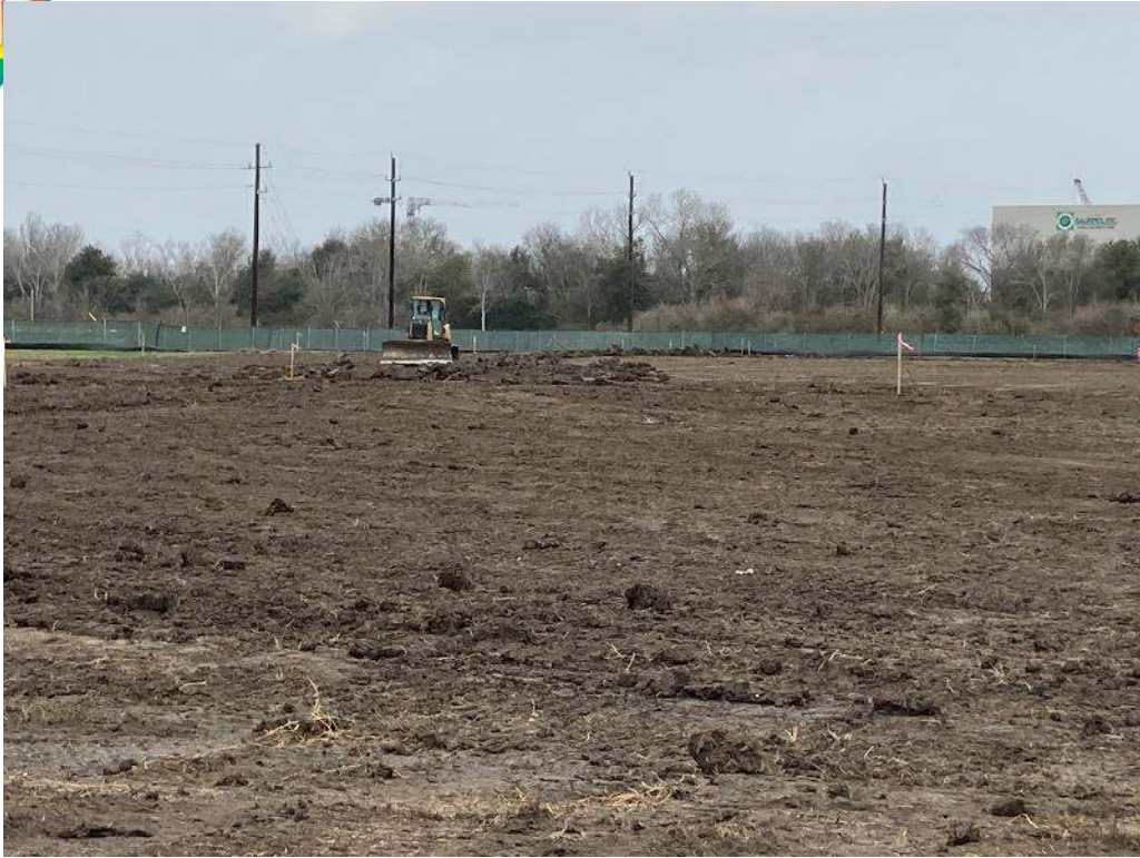
Grading of Miracle Field