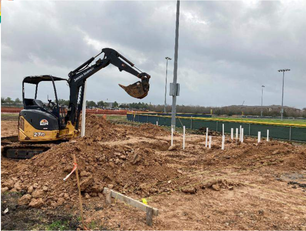
Installation of Plumbing Underground