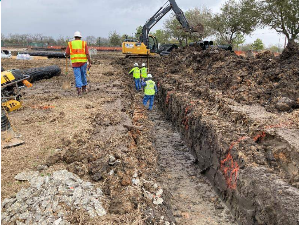
Installation of Storm Drain System