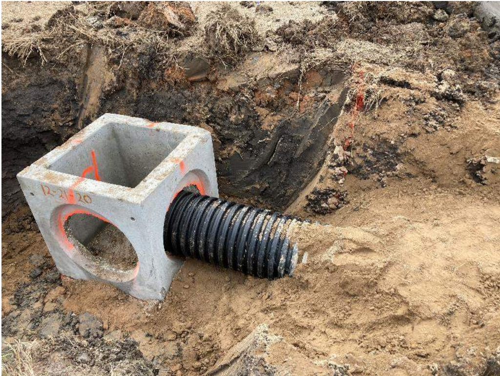
Installation of Storm Drain Inlet boxes