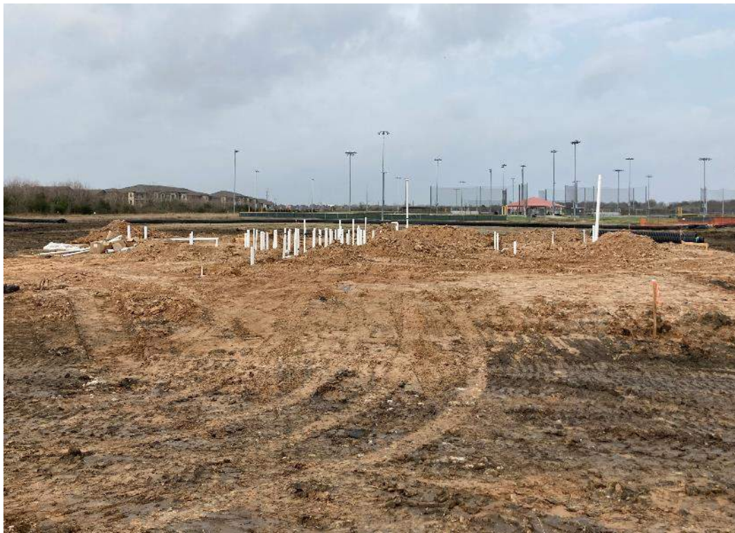
Pad Finished and Plumbing Underground Installed