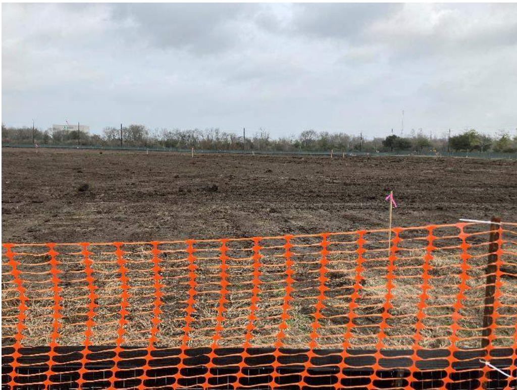
Future Miracle Field