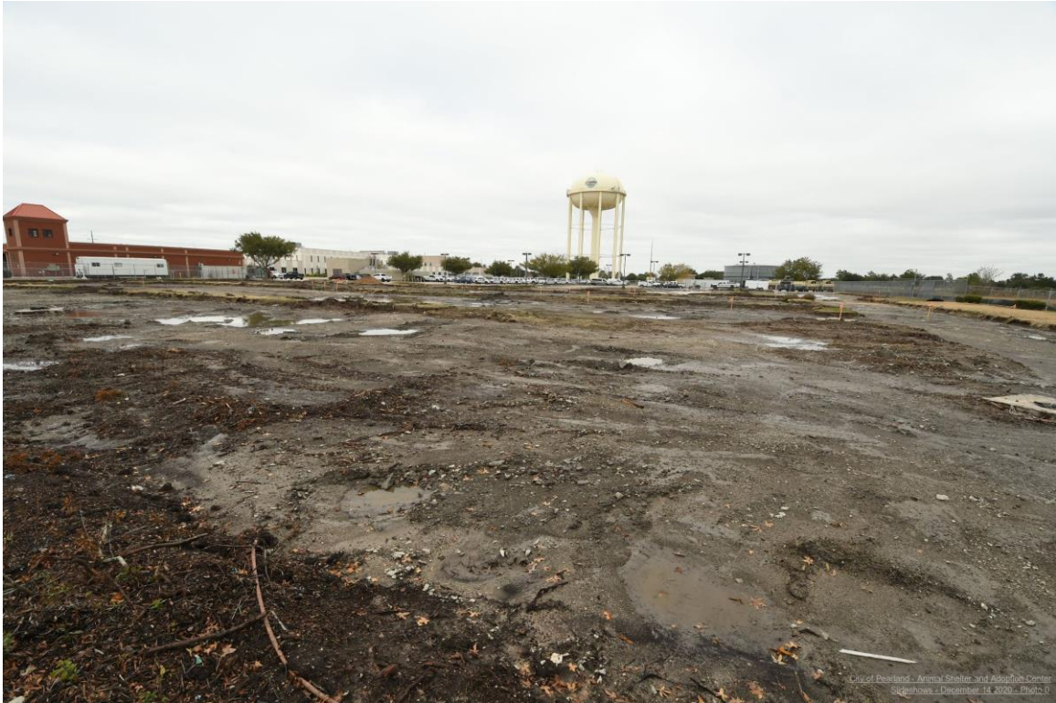
Site Has Been Demoed