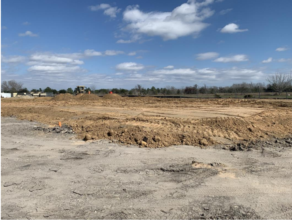
Select Fill Has Been Imported and Compacted