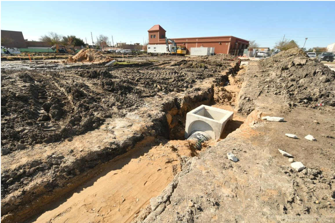
Storm Has Been Installed