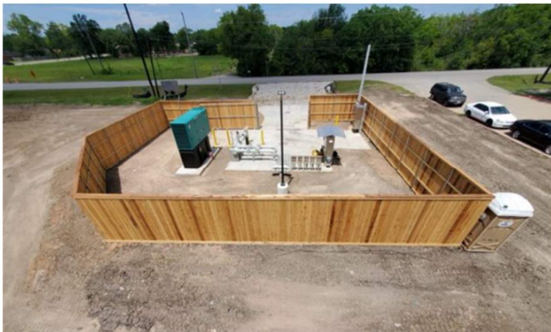
Package 2 - Orange/Mykawa LS Enclosure