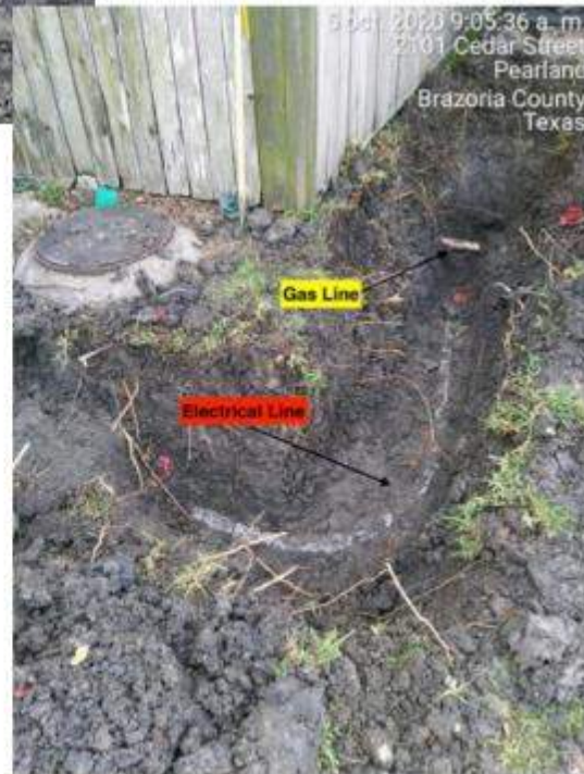
Package 2 – Electrical and Gas lines near MH A-1