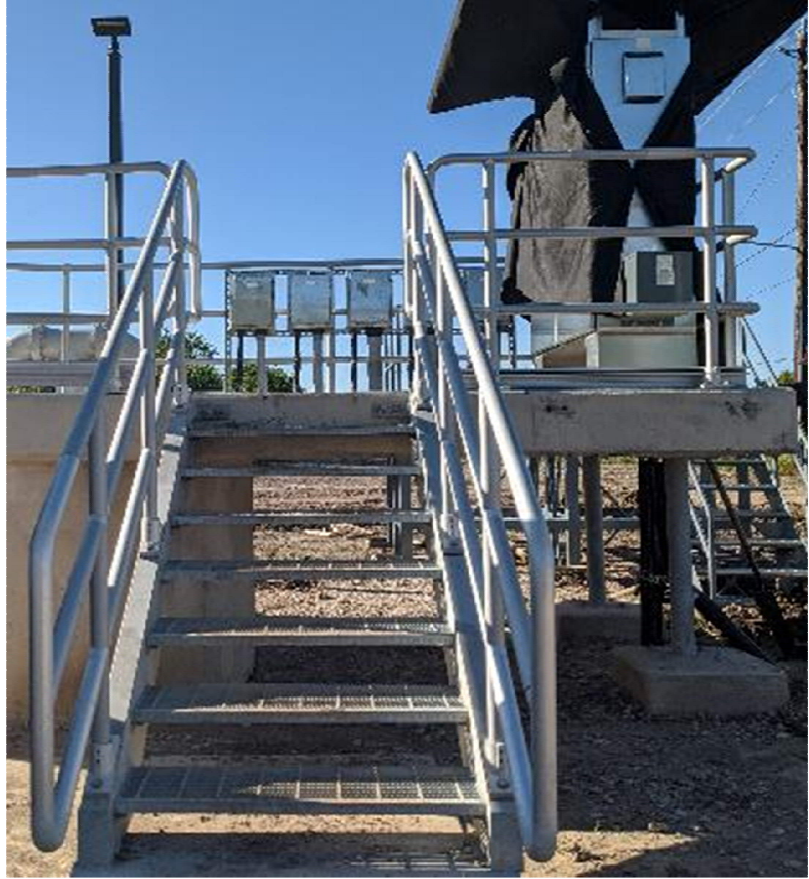
Package 2 -New Stair Case on Scott/Mykawa LS