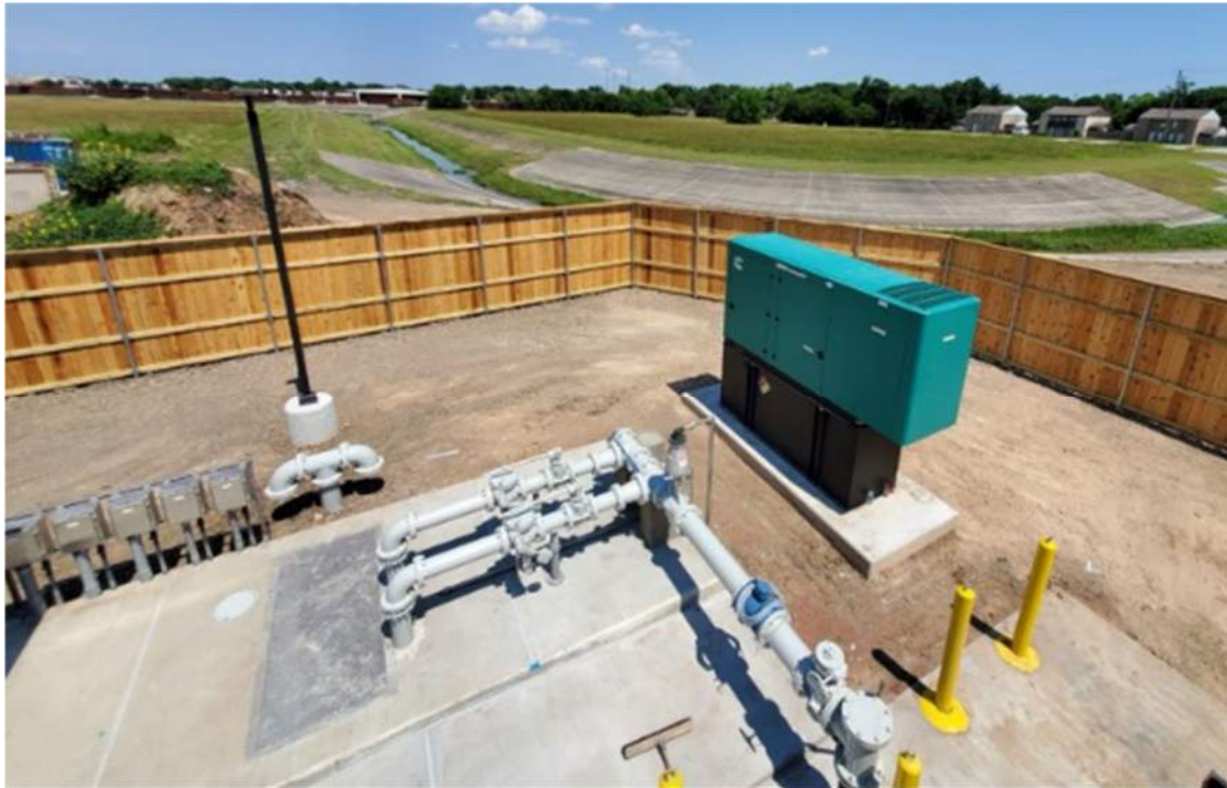
Package 2 - Orange/ Mykawa New Generator