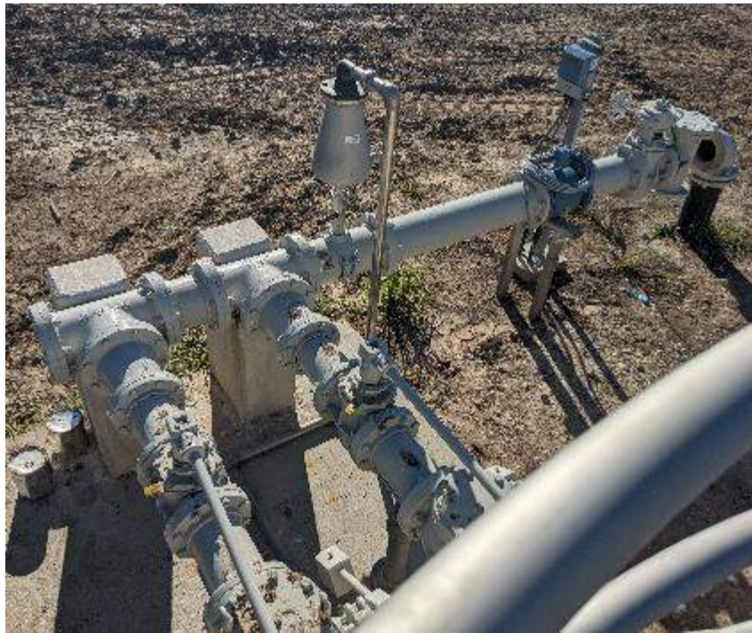
Package 2- New Discharge Piping