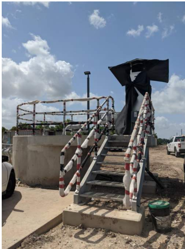
Package 2 – Lift Station