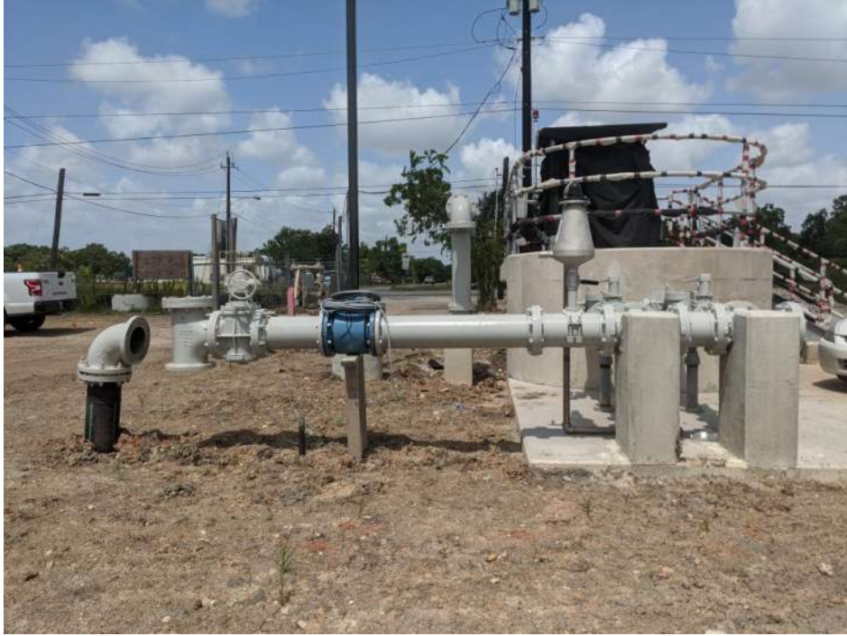
Package 2 – Lift Station