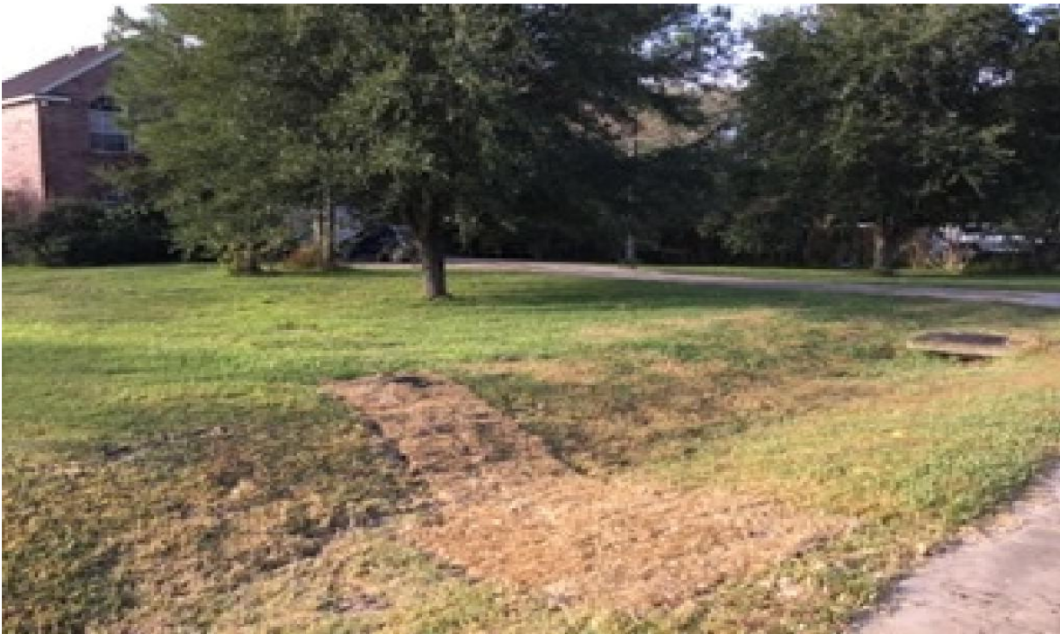
Site restoration along W. Orange Street.