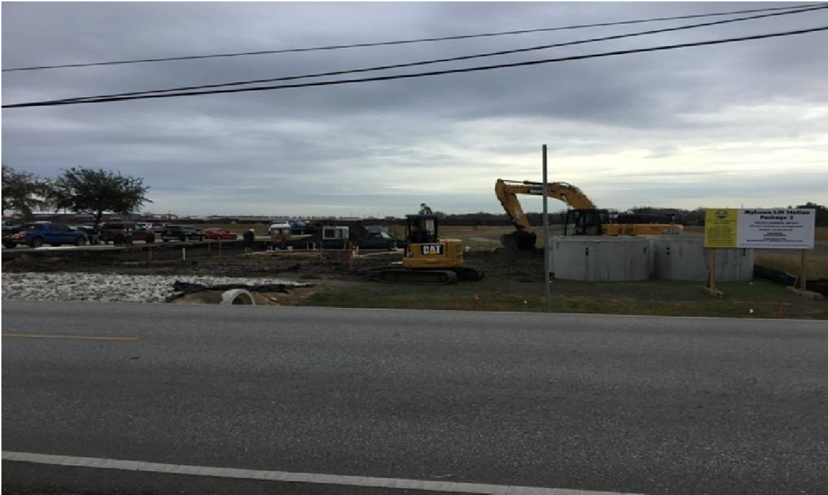
Dewatering for the proposed Orange-Mykawa lift station- wet well.