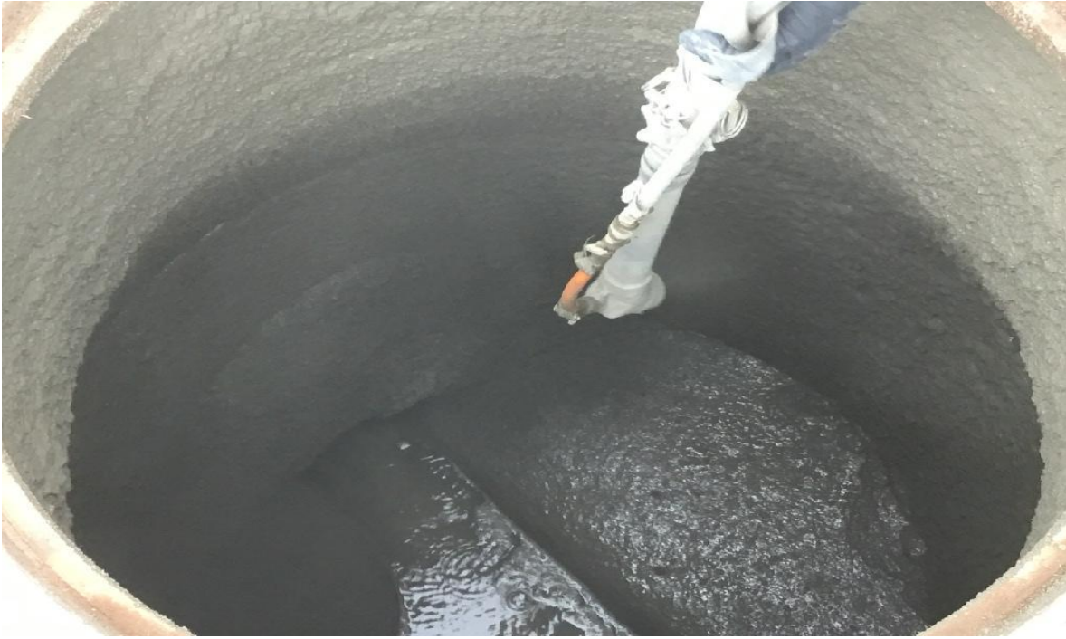
Interior lining (Sewper Coat) being applied for extended protection inside of manhole.