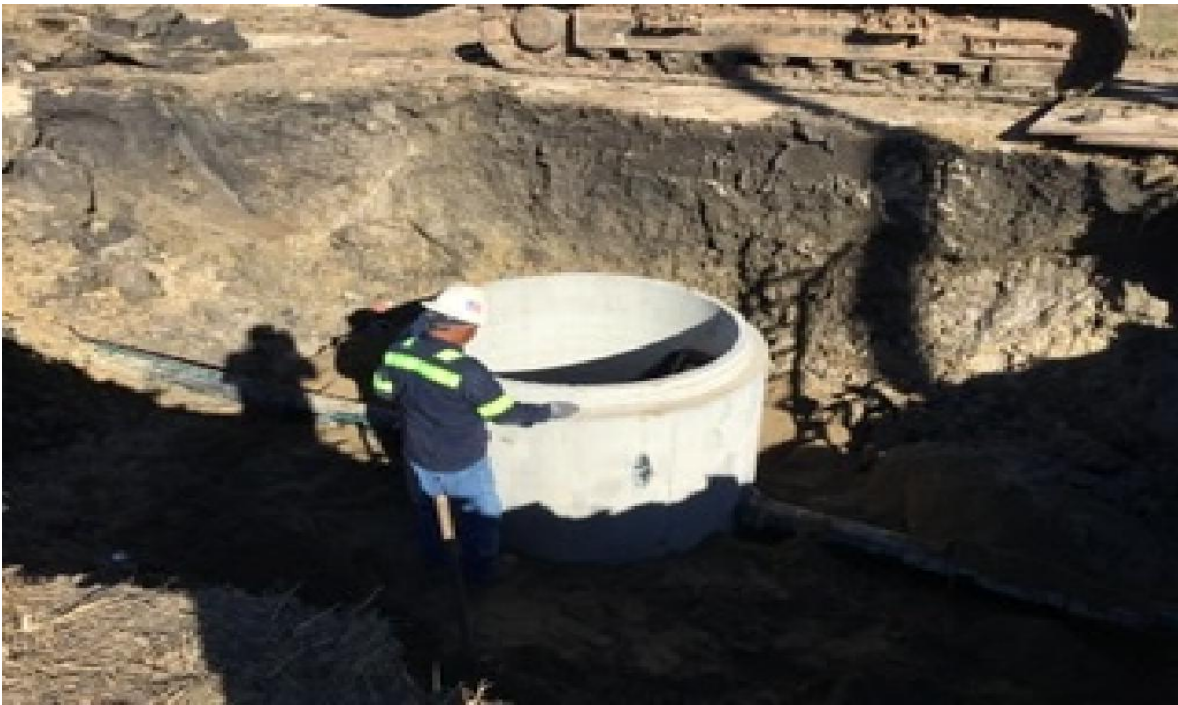
Air release manhole installation for force main.