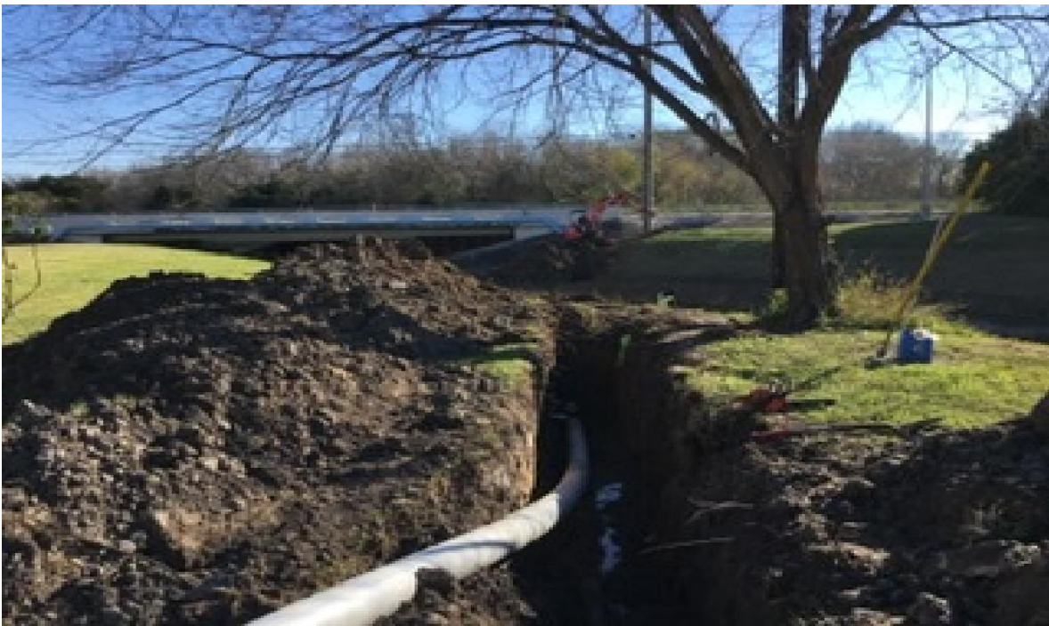
Open trench installation of 8" sanitary sewer force main.