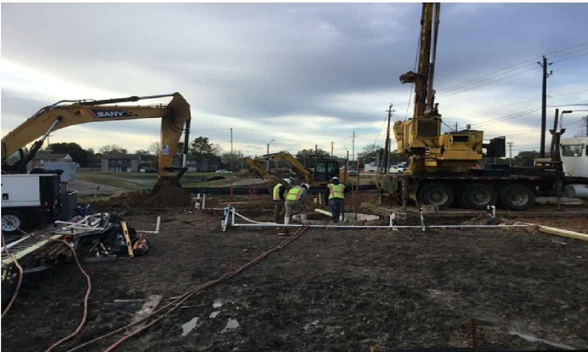
Installation of the Orange-Mykawa lift station wet well.