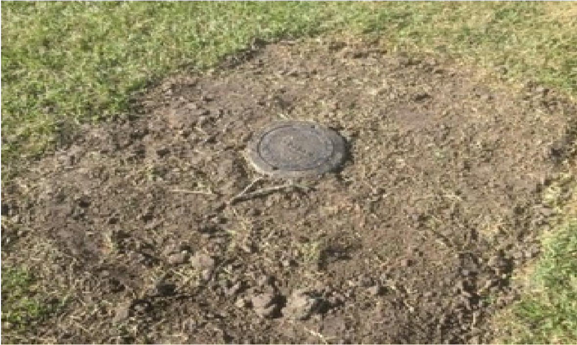
Cast iron frame and covers for residential cleanouts.