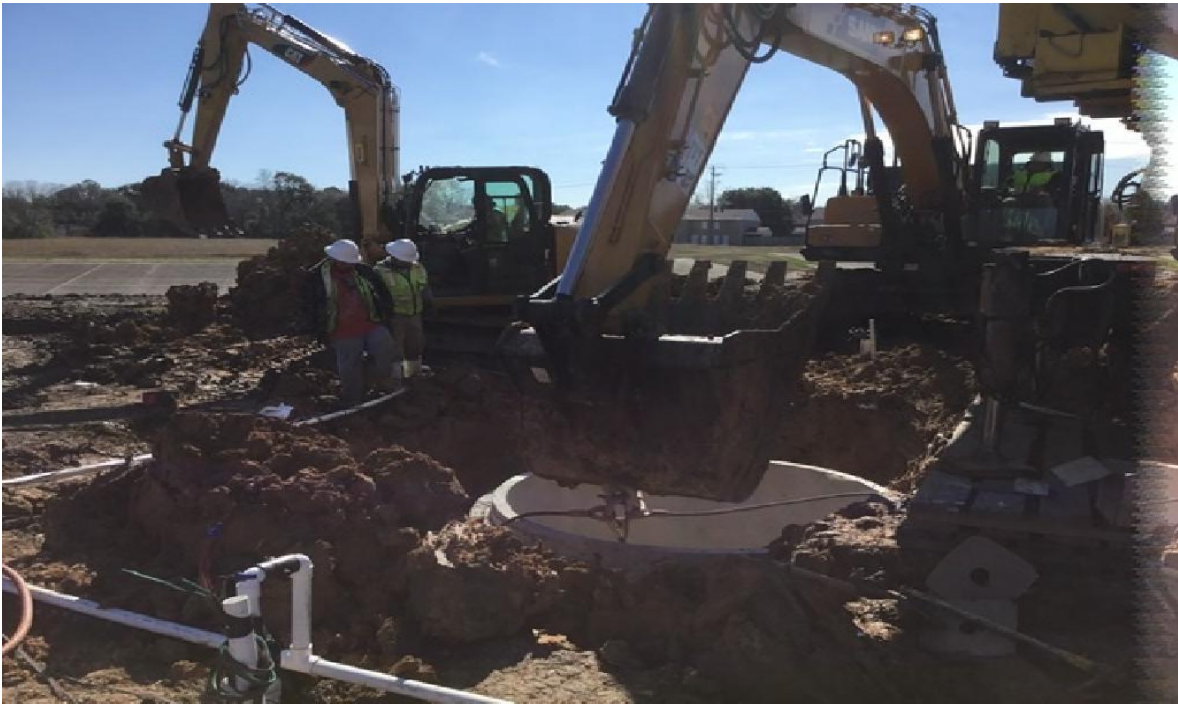
Installation of the Orange-Mykawa lift station wet well.