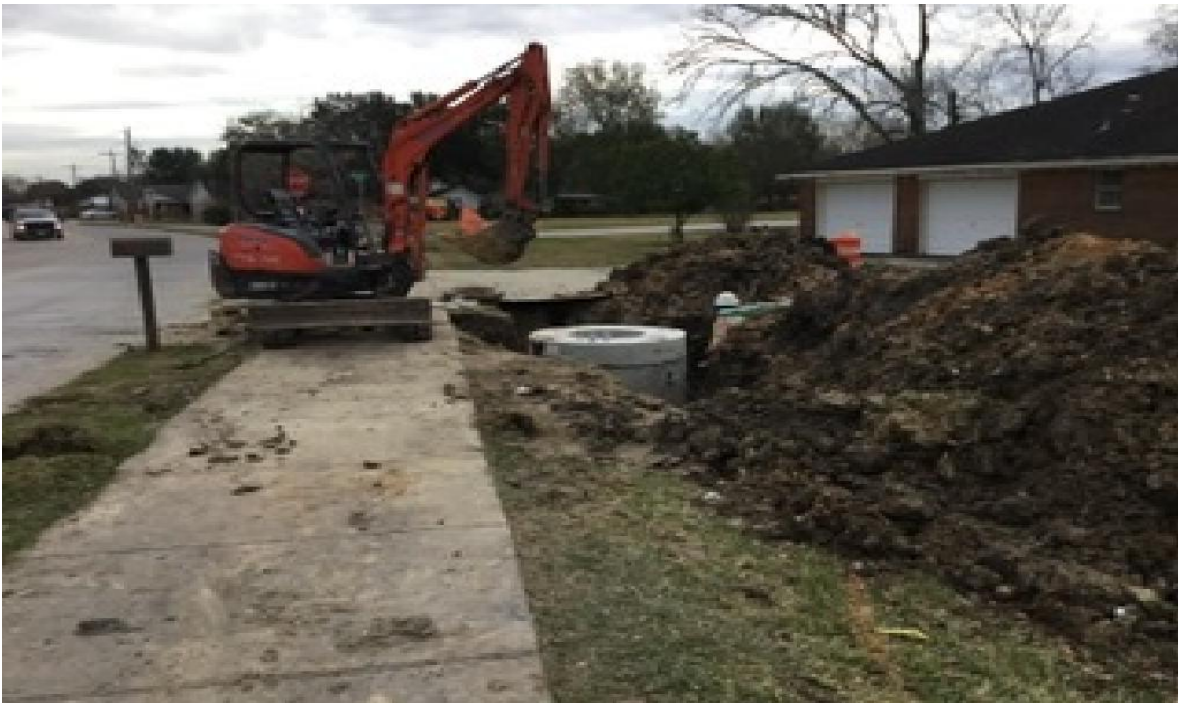
Manhole installation at the corner of Woody Street and W. Orange Street.