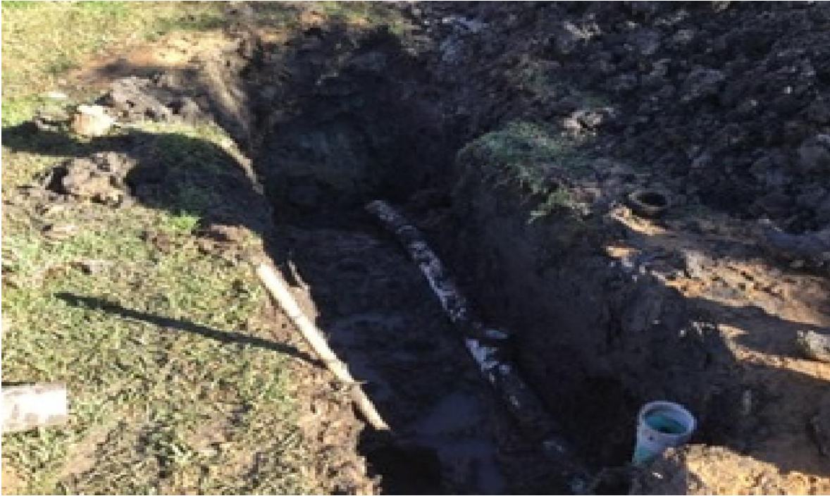
Residential sewer cleanout installation.