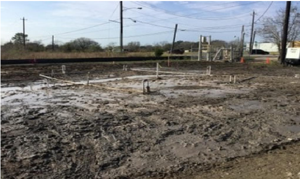
Dewatering for the proposed Scott-Mykawa lift station wet well.