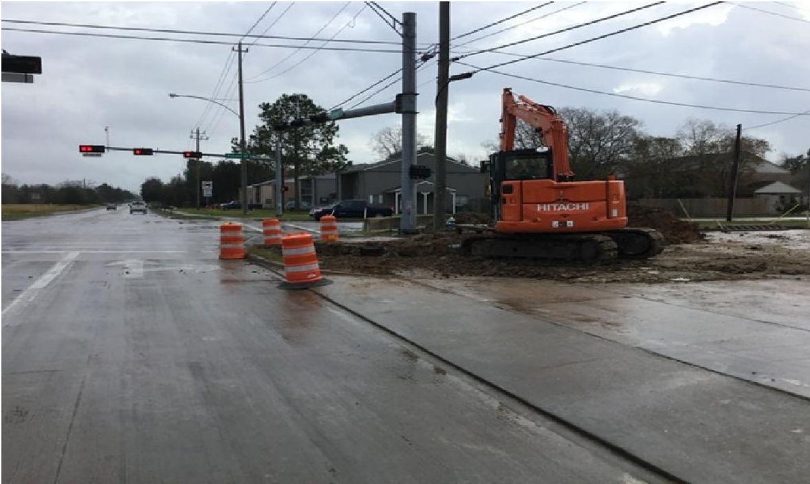
Bore pit set up for upcoming jack and bore activity at the intersection of Orange Street and Mykawa Road.