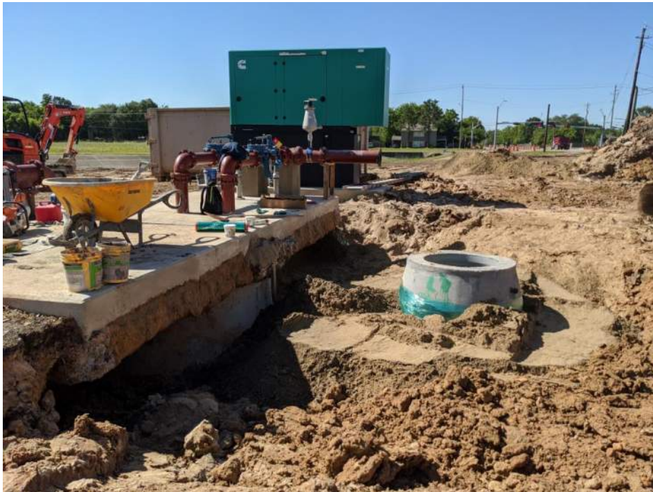
Mykawa and W. Orange Lift Station – Package 2