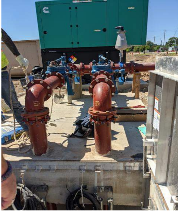
Inside of Mykawa and W. Orange Lift Station – Package 2