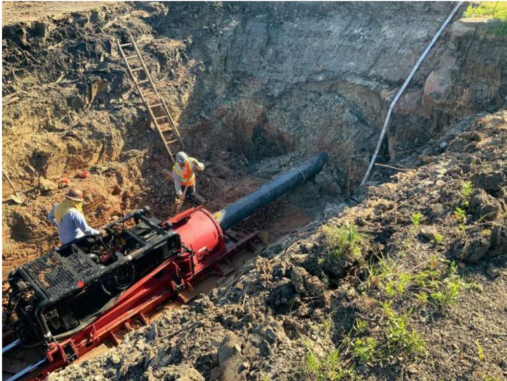
Dry boring under railroad for Package 3.