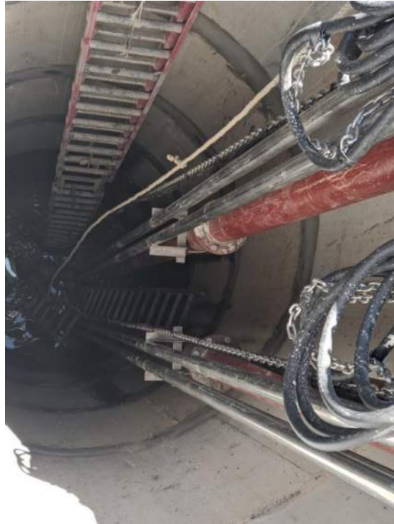
Inside of Mykawa and W. Orange Lift Station – Package 2