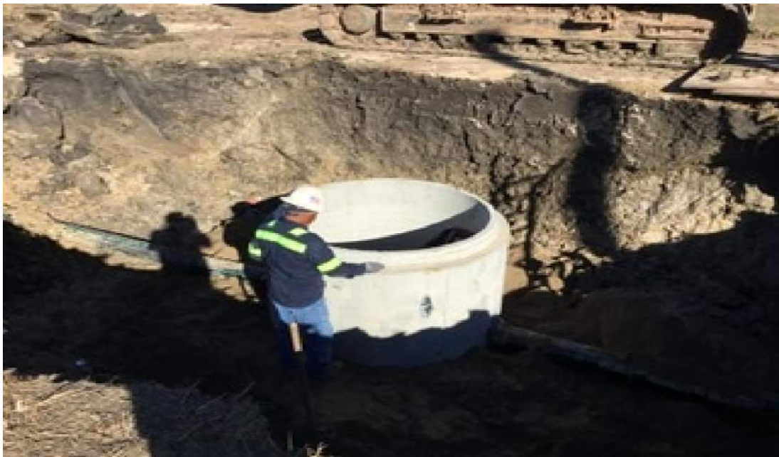
Air release manhole installation for force main.