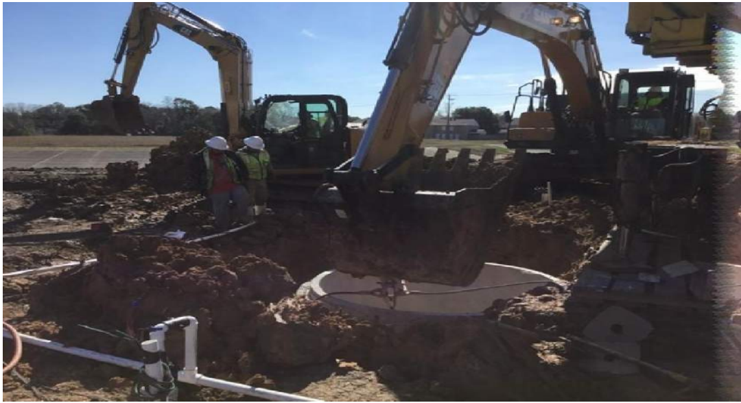
Installation of the Orange-Mykawa lift station Manhole