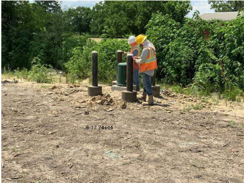
Pipe bollards to protect ARV installation