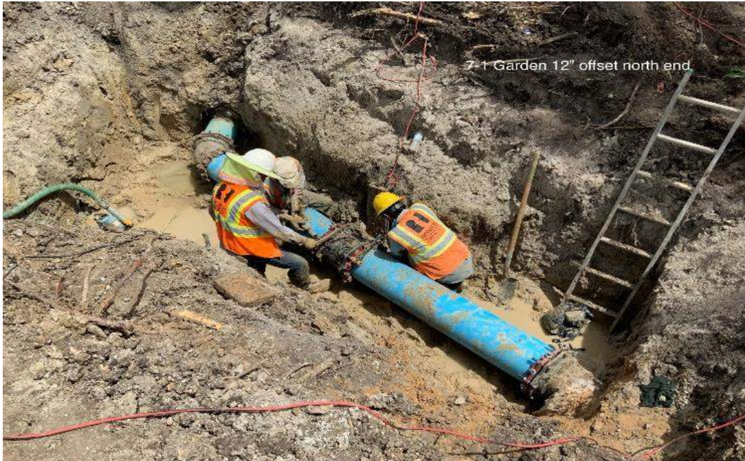
Installing water line off-sets.