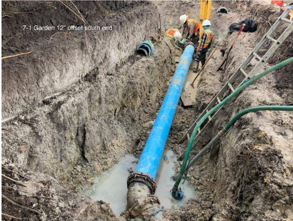
Installing waterline offset using sump pumps to remove water in the excavation