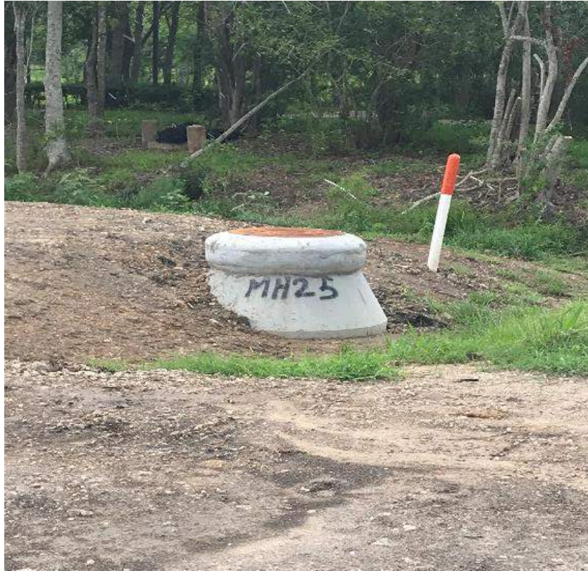
Manhole to grade and exterior grouted.