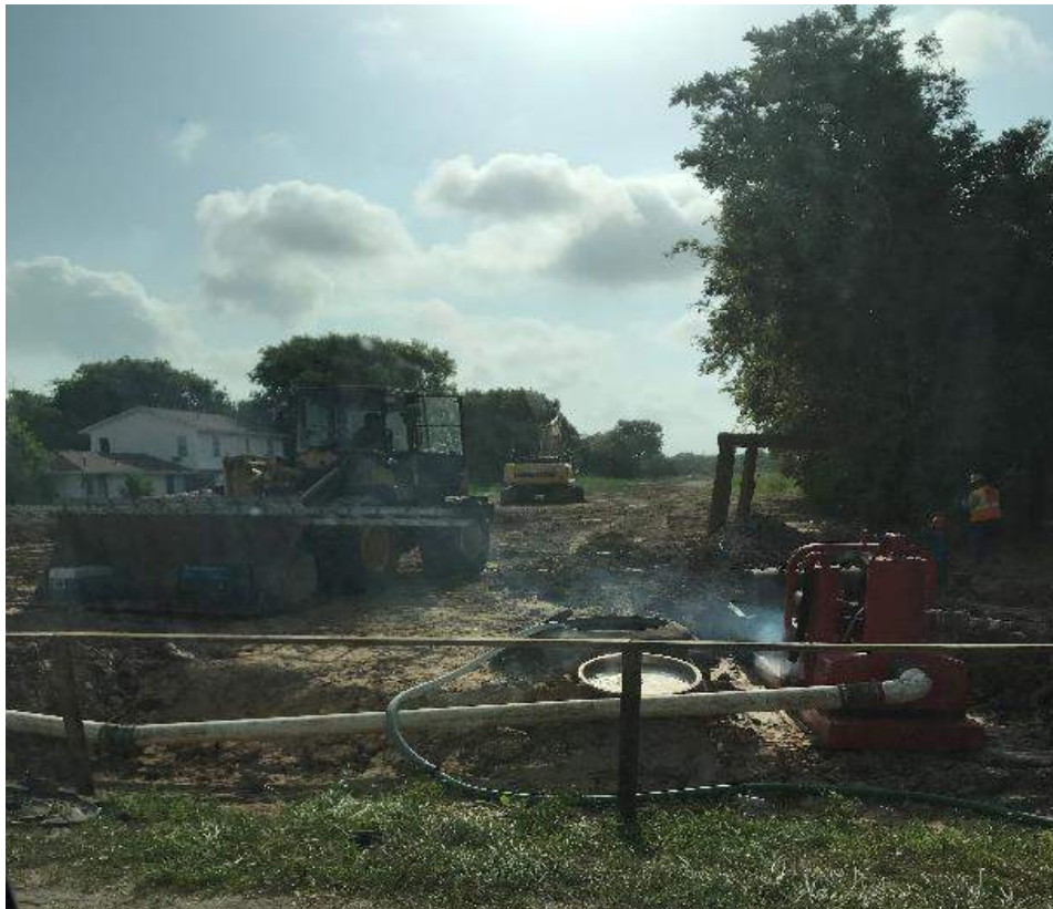
Well pointing at Stone rd.