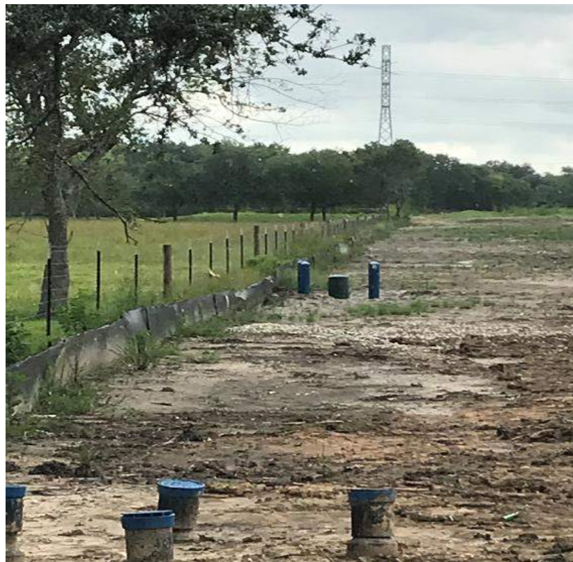
Water Valves and Air Relief Valves (ARVs) installed