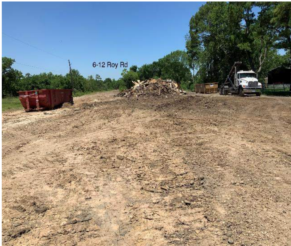
Hauling debris from site demo