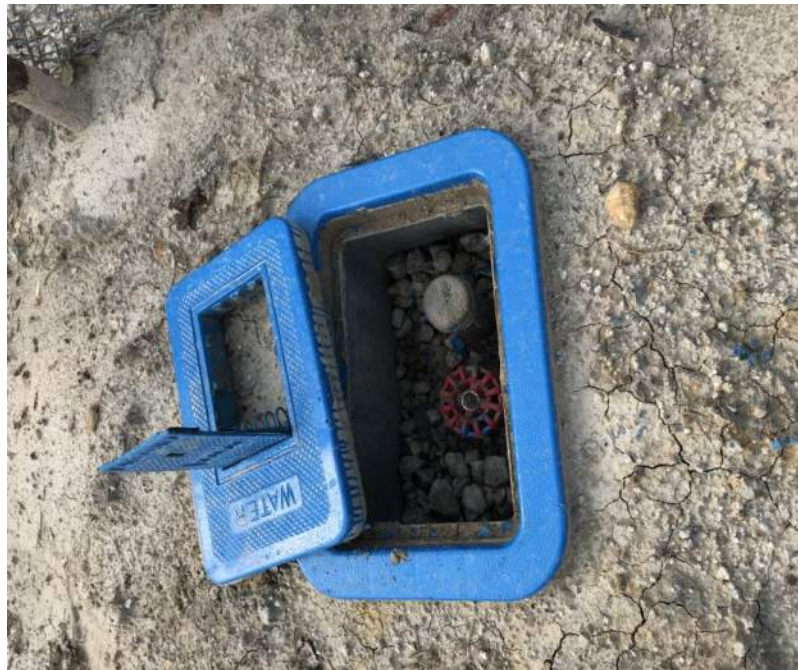
Water line Blow-off