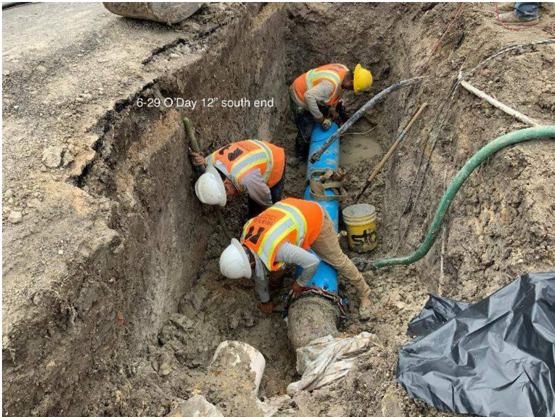
Water line work