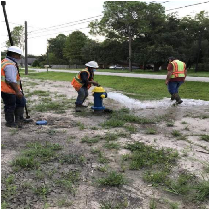
Fire Hydrant inspections