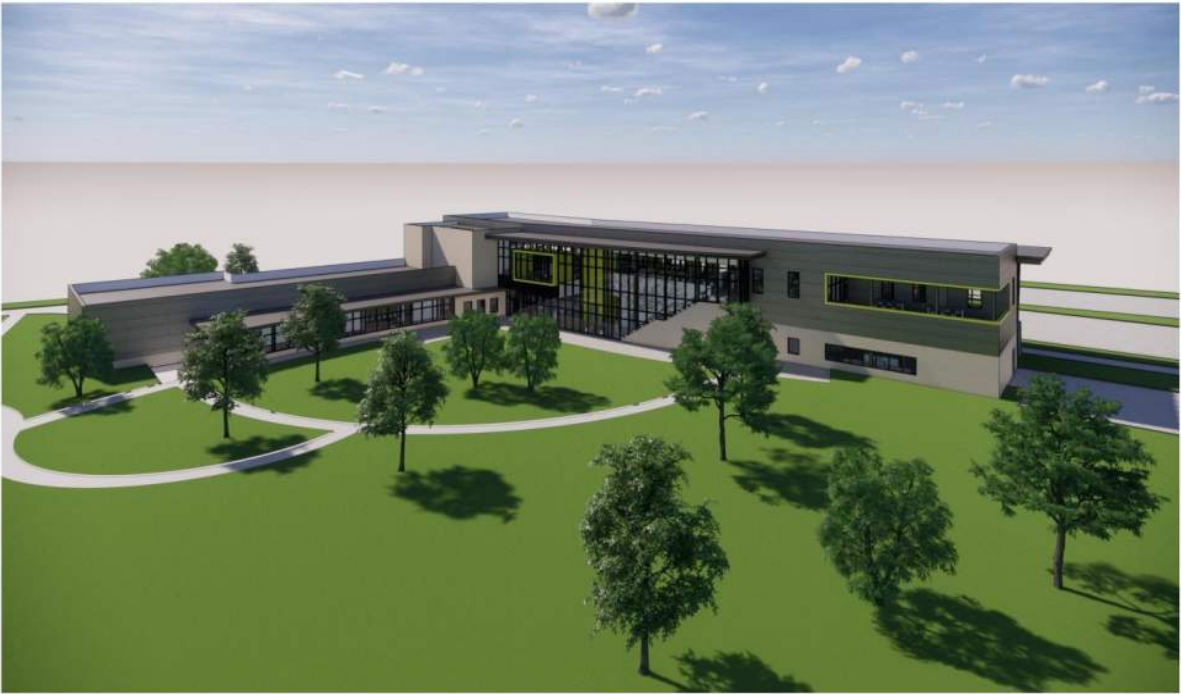
EXTERIOR PERSPECTIVE – BEAR TREE GROVE VIEW