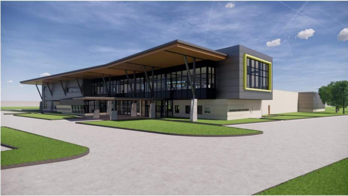
EXTERIOR PERSPECTIVE – FRONT CORNER