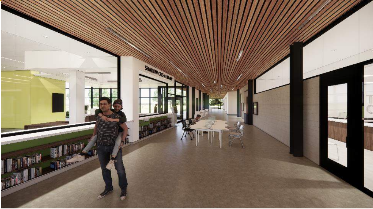
Interior Front Lobby