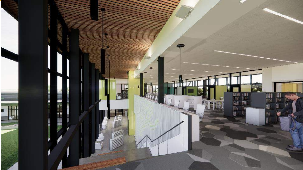
2nd Level & Feature Wall