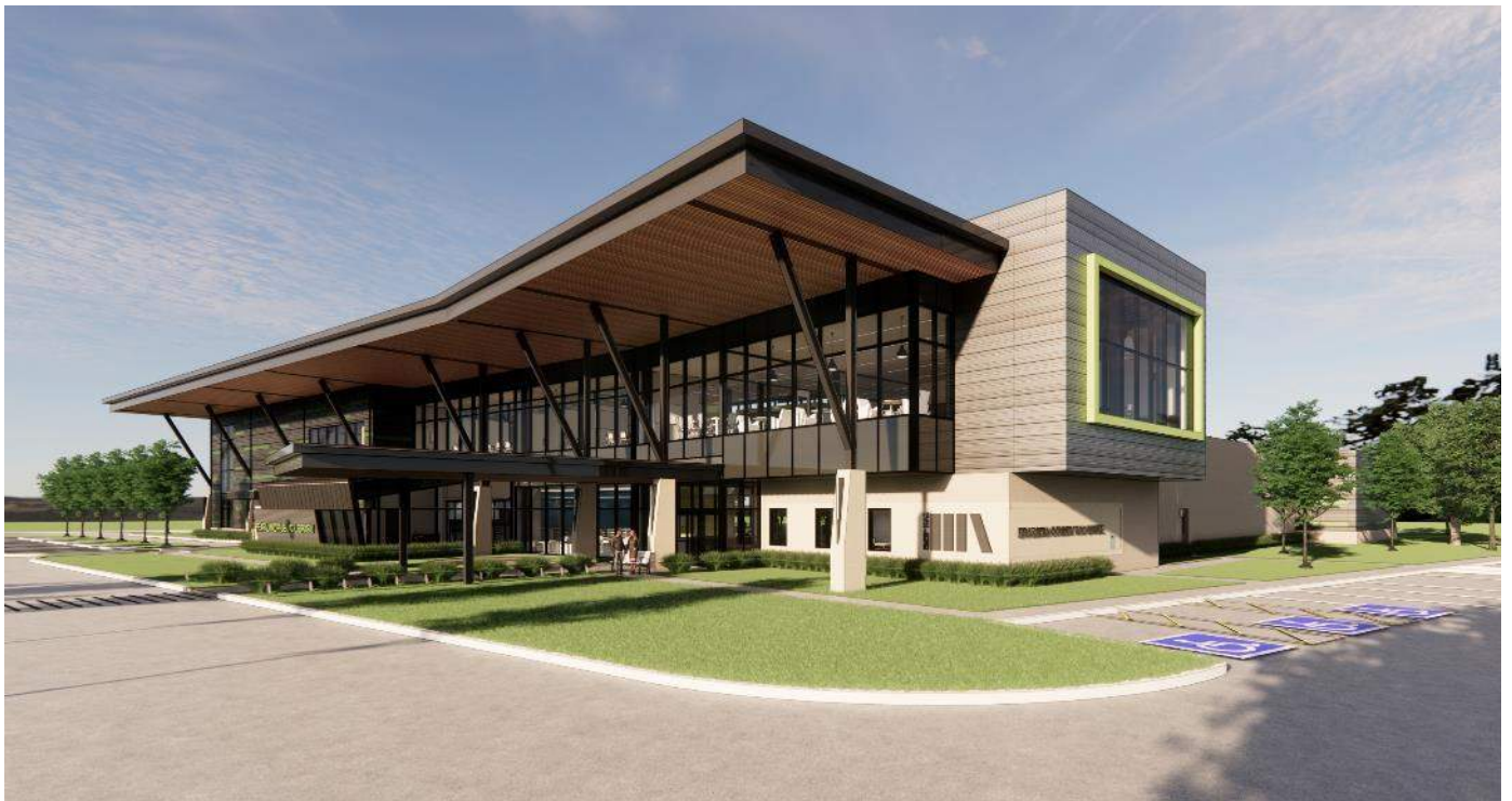
Exterior Front Entry