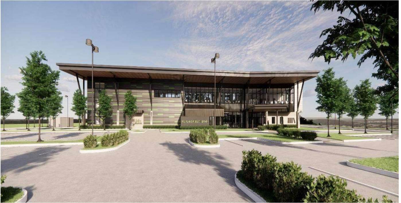
Exterior Front View