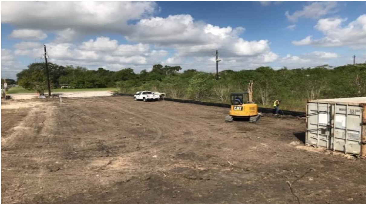
Clearing and grubbing of the proposed Scott-Mykawa LS site and office trailer delivery.