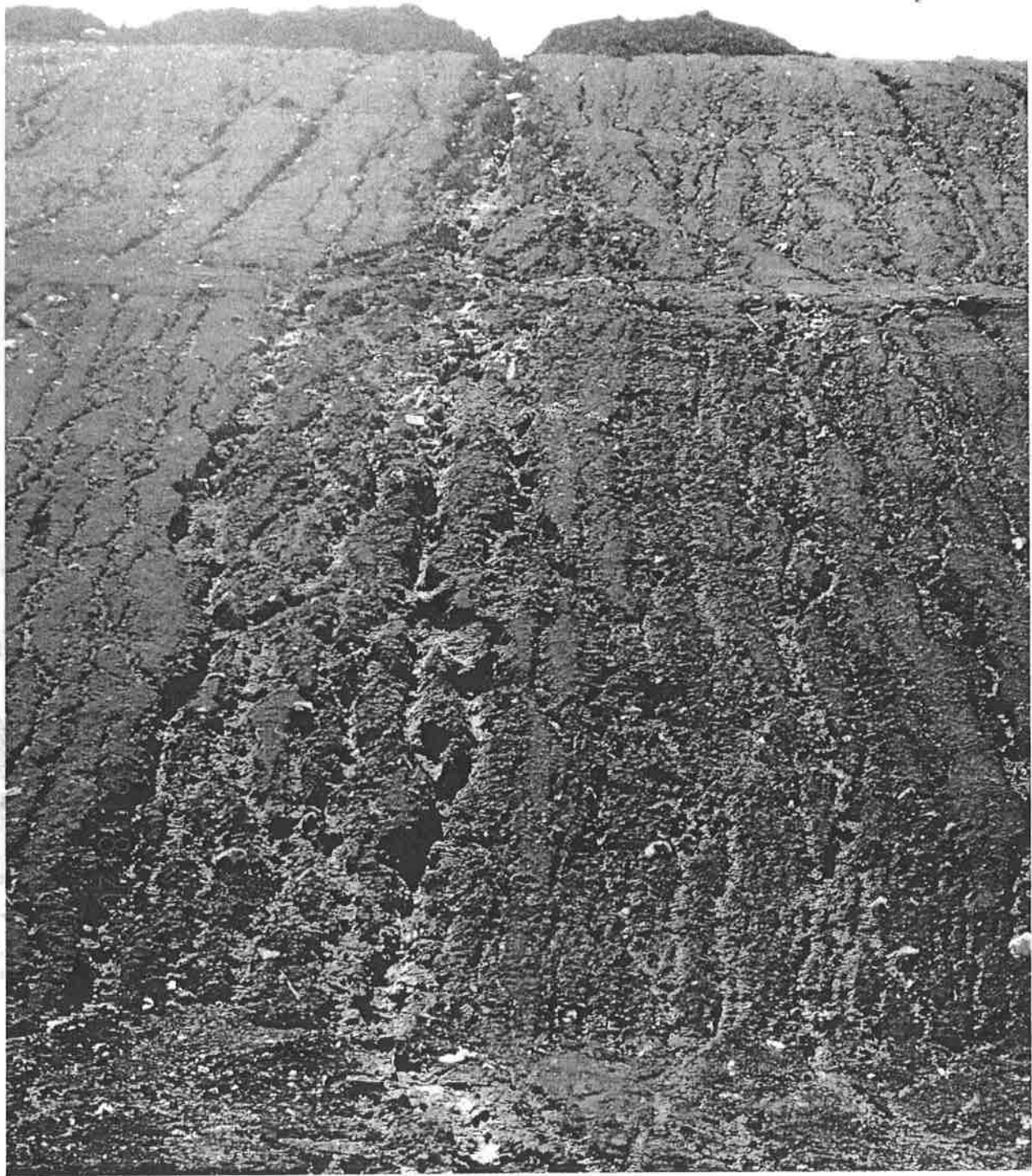
Photograph 2 of 2: Erosion of cover was observed.