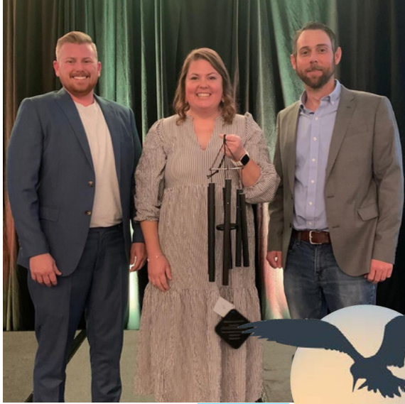
Delores Fenwick NATURE CENTER